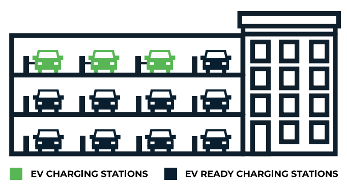
Large project review developments and all developments in the Parking Freeze Zone must equip 25% of their total parking spaces to be EVSE (electric vehicle supply equipment) installed and the remaining 75% of the total spaces to be EV (electric vehicle) ready.

On March 7, 2019, Boston's Mayor Martin J. Walsh announced new electric EV infrastructure requirements for parking garages<sup>2</sup>. The policy applies to all new parking garages including large developments required to undergo the Transportation Access Plan Agreement. and in any new development in the South Boston or Downtown Parking Freeze Zones as defined by the Air Pollution Control Commission. The policy requires 25% of parking spaces in new off-street parking areas shall be equipped with electric vehicle charging stations, and the remaining 75% shall be EVSE Ready, at a minimum, equipped to accommodate electric vehicle infrastructure expansion.