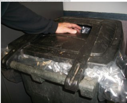
The Redemption Center Trash Toter gets customized for Wyman's needs.