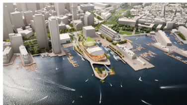
The Blueway The Blueway New England Aquarium Project Team: Stoss; CBT Architects; Continuum http://www.stoss.net/projects/49/the-blueway/