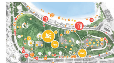
Moakley Park Program Diagram Moakley Park Vision Plan City of Boston Project Team: Stoss; ONE Architecture, Nitsch Engineering