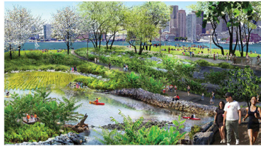
East Boston / Piers Park II and III One Waterfront Trustees of Reservations