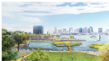
Border Street Priority Area Coastal Resilience Solutions for East Boston and Charlestown City of Boston Project Team: Klienfelder; Stoss; ONE Architecture; Woods Hole Group