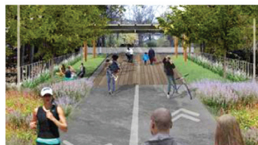
DOT Greenway Vision DOT Greenway Vision Greater Ashmont Main Street Project Team: OJB Landscape Architecture