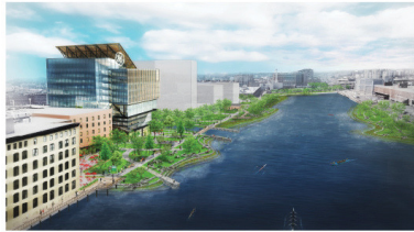
Fort Point Park Coastal Resilience Solutions for South Boston City of Boston Project Team: ARCADIS; Halvorson Design Partnership; CivicMoxie; Woods Hole Group; Noble, Wickersham, and Heart LLP