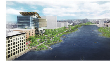
Fort Point Park Coastal Resilience Solutions for South Boston City of Boston Project Team: ARCADIS; Halvorson Design Partnership; CivicMoxie; Woods Hole Group; Noble, Wickersham, and Heart LLP