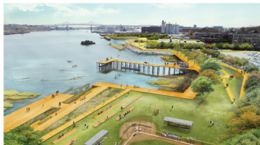
Schraft's Center and Ryan Playground Coastal Resilience Solutions for East Boston and Charlestown City of Boston Project Team: Klienfelder; Stoss; ONE Architecture; Woods Hole Group