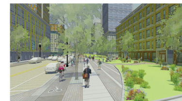
Ellery Street Park Dorchester Avenue Plan Boston Planning and Development Agency