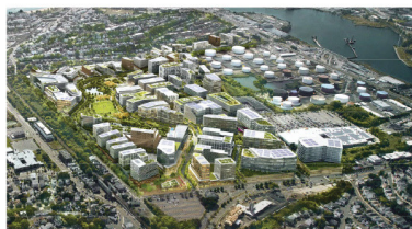
Suffolk Downs Redevelopment Suffolk Downs Redevelopment: Expanded Environmental Notification Form/ Expanded Project Notification Form The HYM Investment Group, LLC, The McClellan Highway Development Company, LLC Project Team: DLA Piper; CBT Architects; Beals and Thomas, Inc.; Stoss; LimnoTech; ARUP; SourceOne; Vertex; Haley & Aldrich