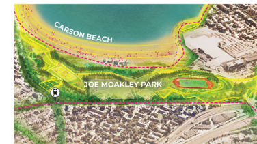
Moakley Park Resilient Harbor Concept Resilient Boston City of Boston Project Design Team: Stoss; ONE Architecture, Nitsch Engineering