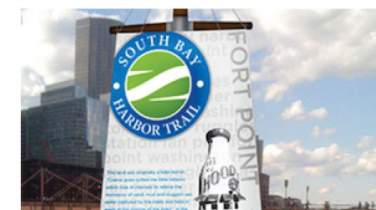
South Bay Harbor Trail Wayfinding Save the Harbor, Save the Bay City of Boston Project Team: Design Consultants, Inc.