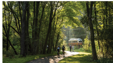
Neponset River Greenway Massachusetts Department of Conservation and Recreation Project Team: Crosby, Schlessinger, Smallridge, LLC http://www.cssboston.com/portfolio/neponset-greenway/