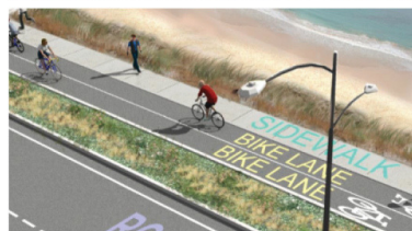
Morrissey Boulevard Redesign for Reconstruction DCR Public Meeting - #2 Massachusetts Department of Conservation and Recreation