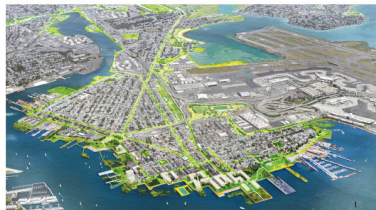
East Boston's Long Term Climate Resilient Strategy Coastal Resilience Solutions for East Boston and Charlestown City of Boston Project Team: Klienfelder; Stoss; ONE Architecture; Woods Hole Group