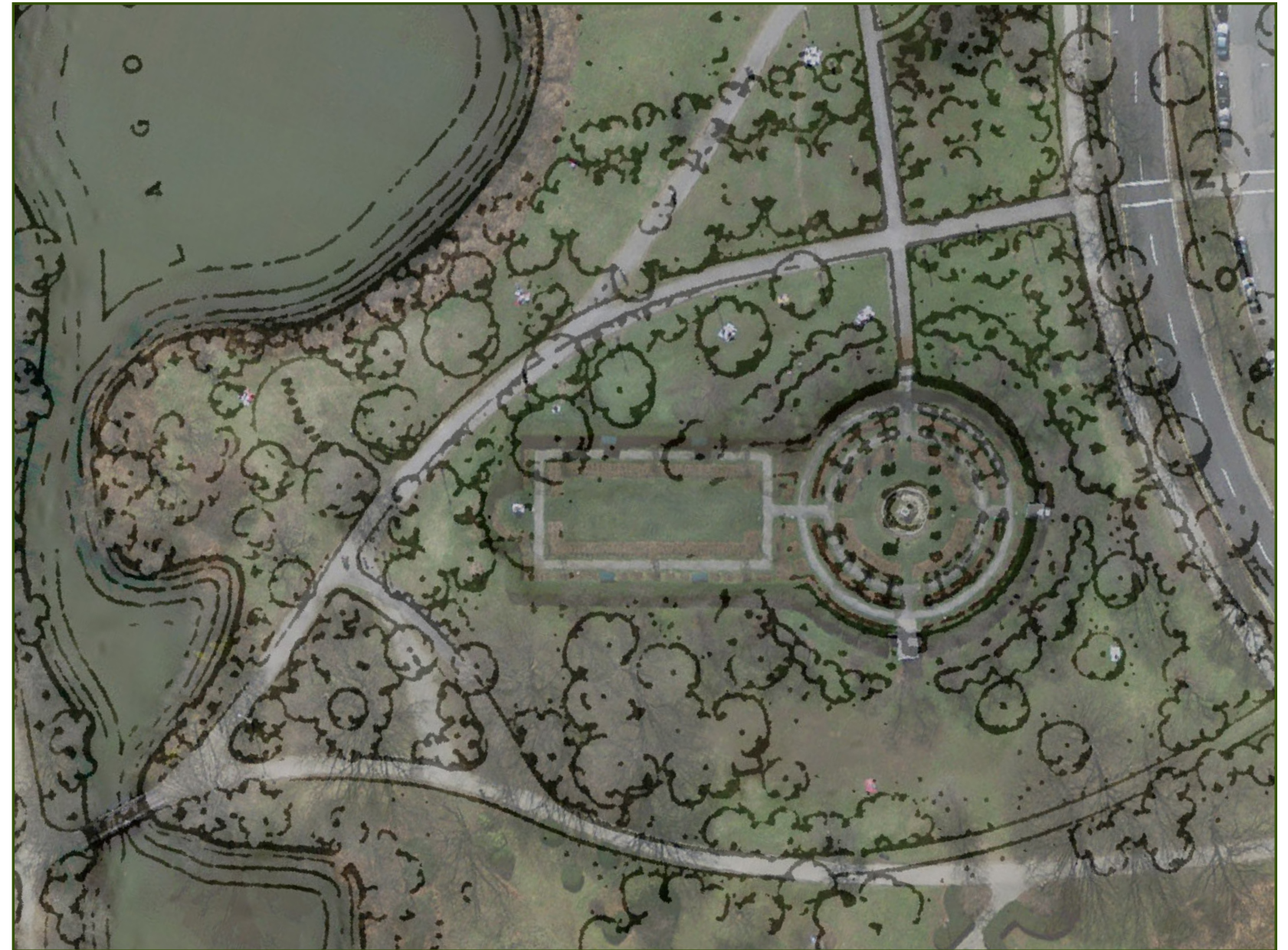
1931 Shurcliff Plan Overlaid on USGS Imagery