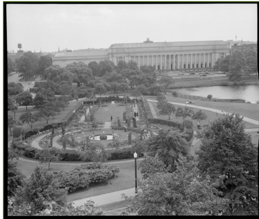
Hedge grew in to obscure the wire fence, 1940.