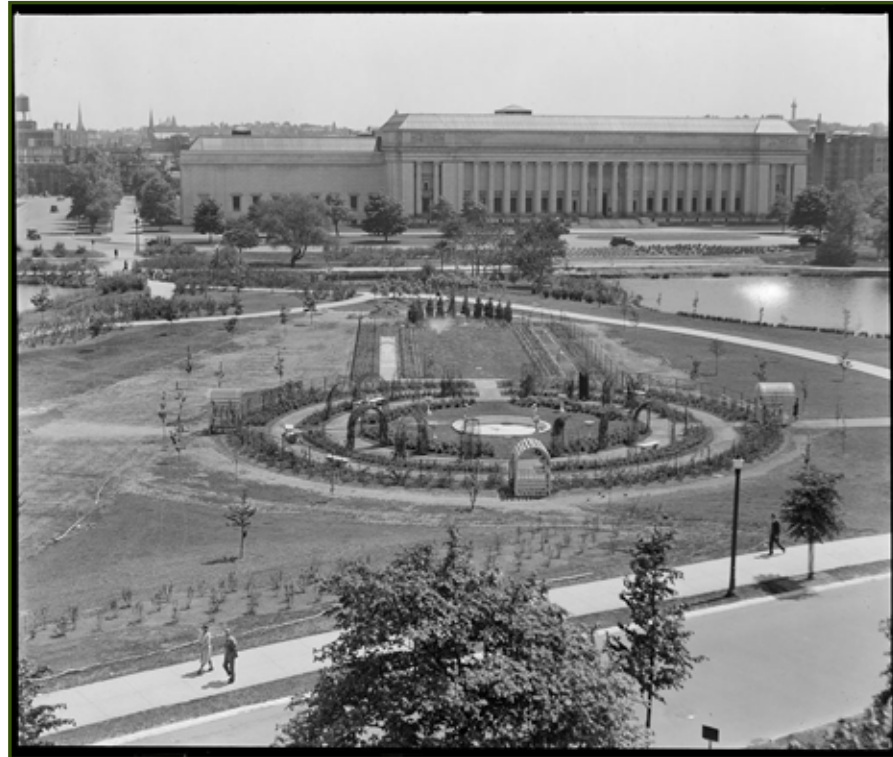
Fence was more exposed when the yews were shorter, 1932.