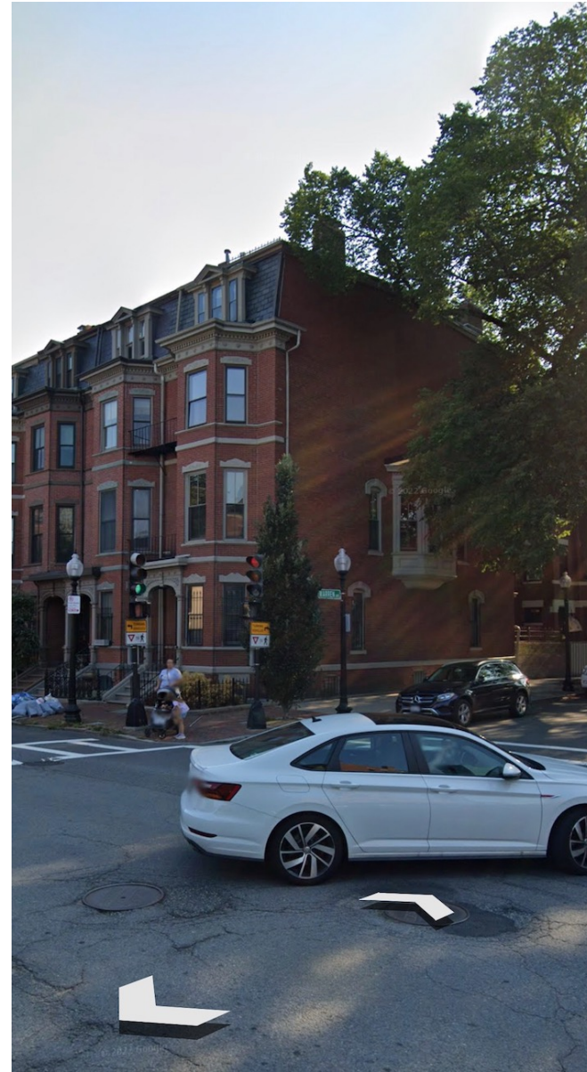
The top of the original deck railing was just visible at the front from approximately 20 feet back from opposite street corner