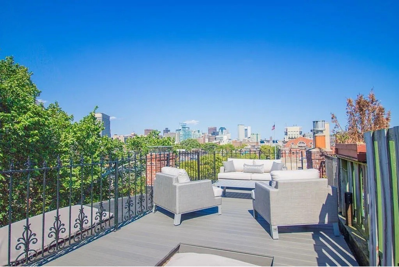
Original deck and iron work