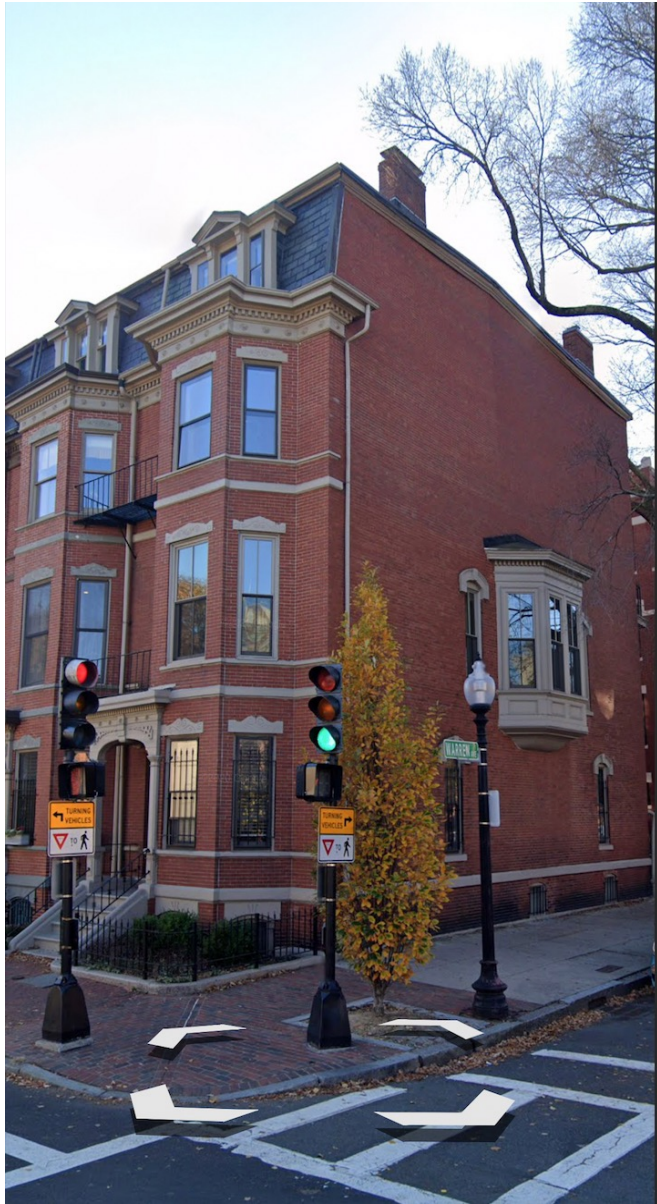
Original deck is not visible from the edge of opposite street corner sidewalk