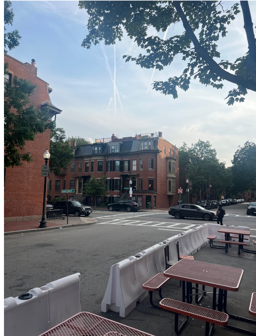
Example of visibility from corner of Dartmouth and Montgomery St (next block down)