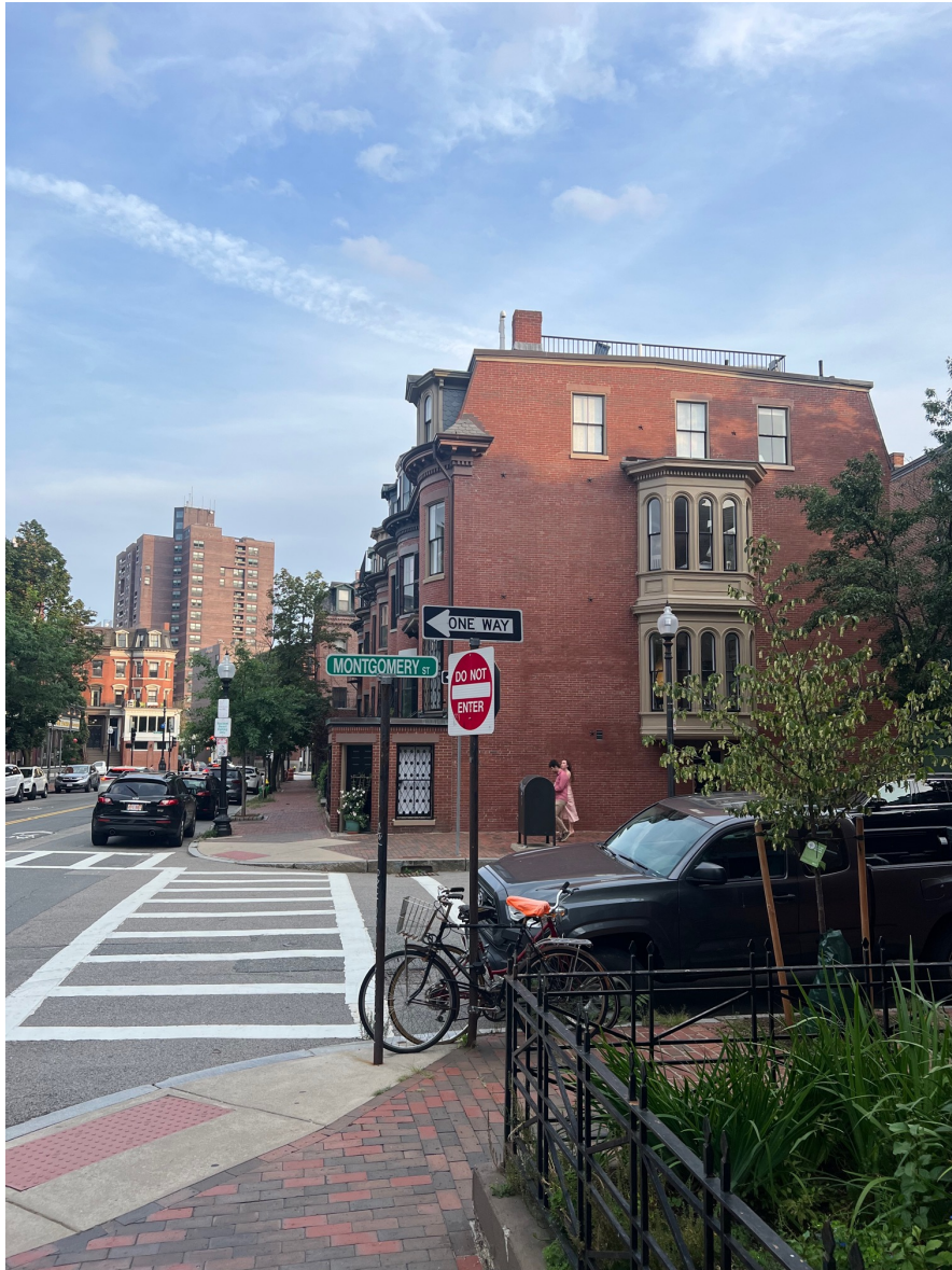
Example of visibility from corner of Dartmouth and Montgomery St (next block down)