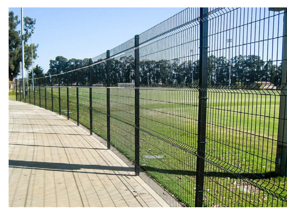
Ameristar Welded Wire Works Plus Fence 4', 6', and 8' heights