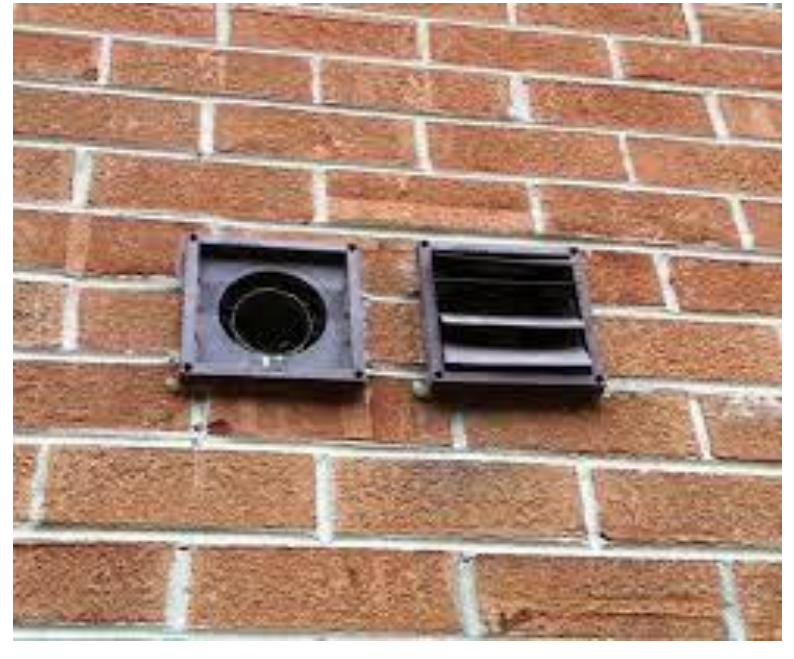
VENT TYPE/STYLE ALTERNATIVES