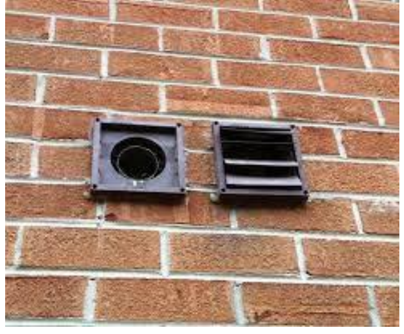
VENT TYPE/STYLE ALTERNATIVES