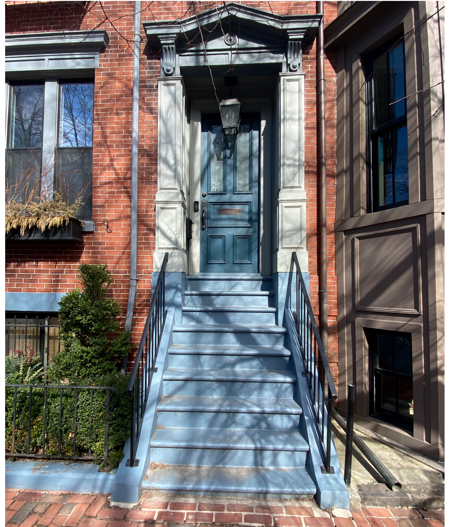
Existing Front Stairs Railing