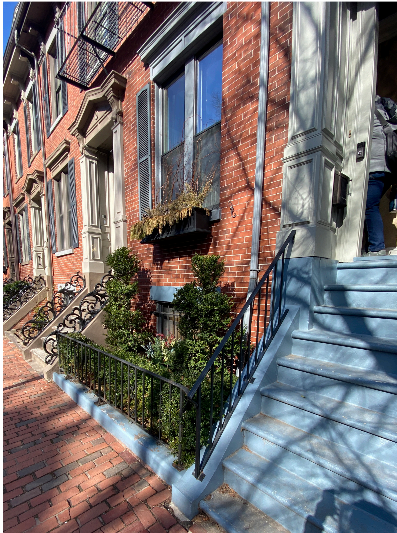
Existing Front Stairs Railing