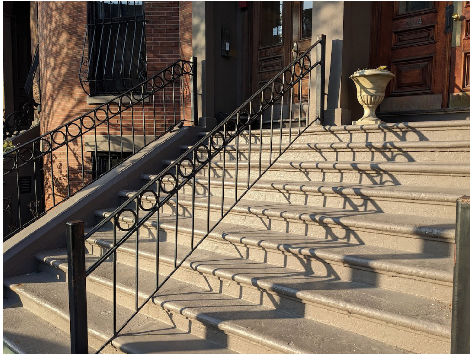
512 Massachusetts Ave.