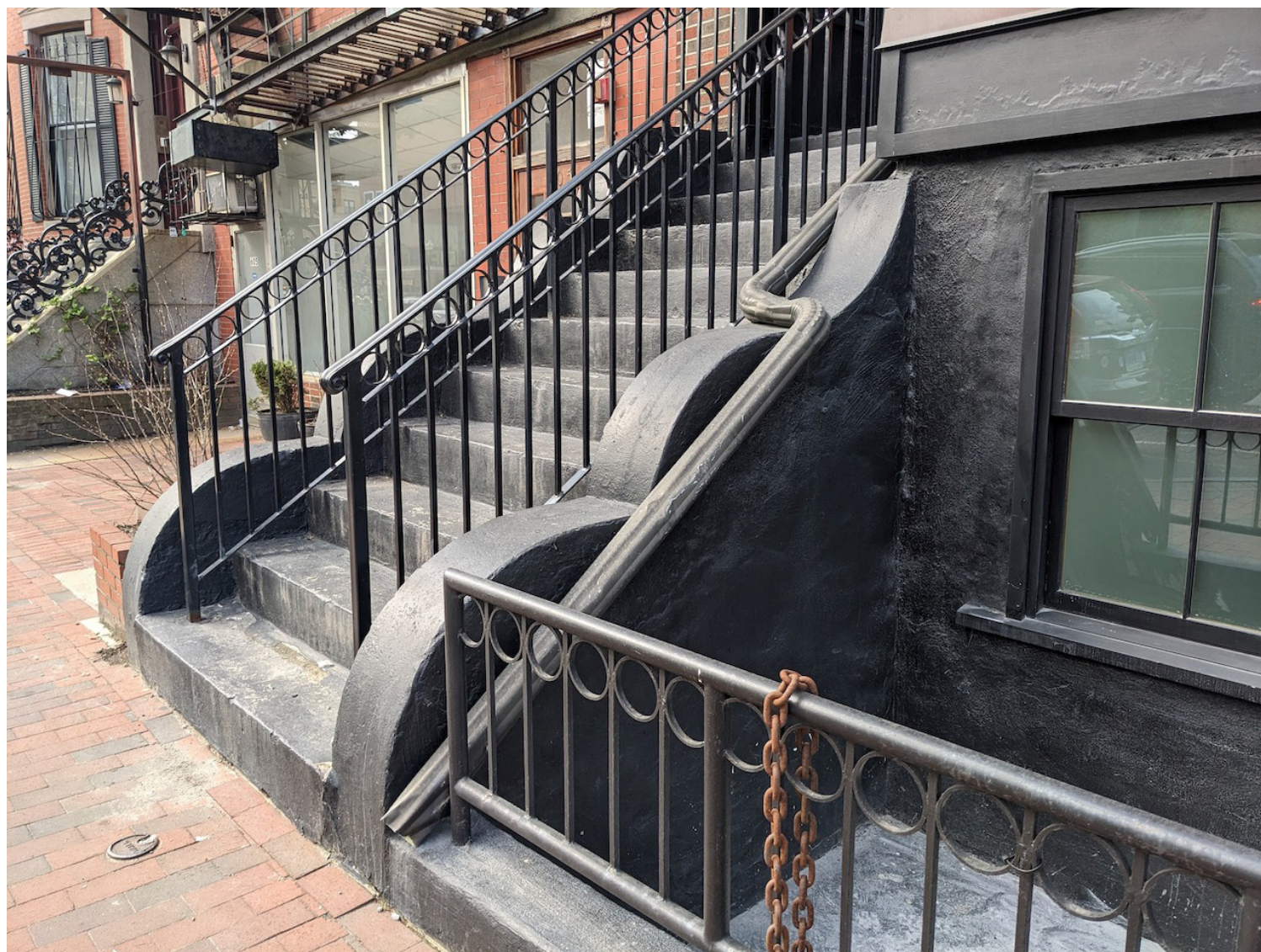
603 Massachusetts Ave.