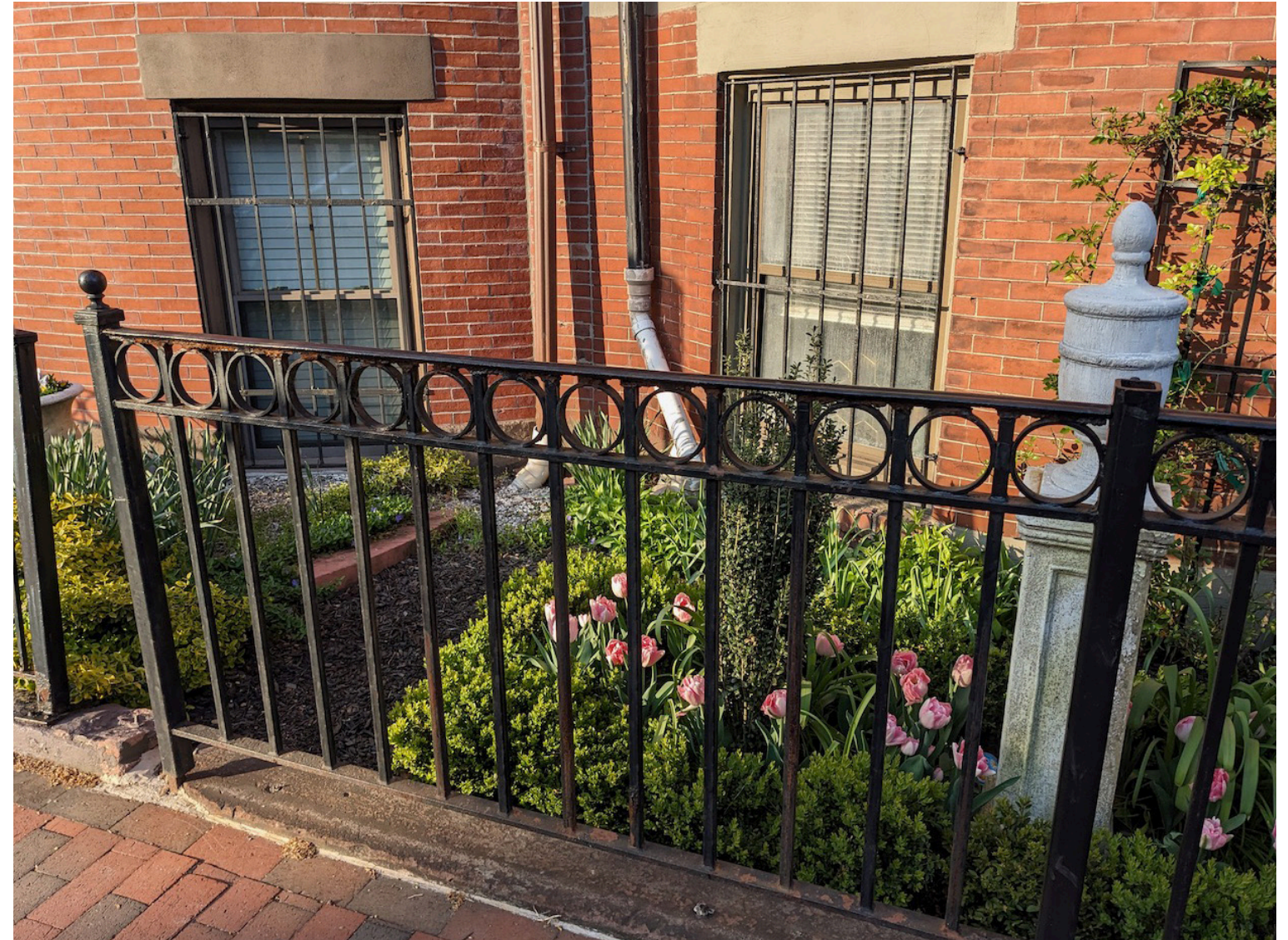
514 Massachusetts Ave.