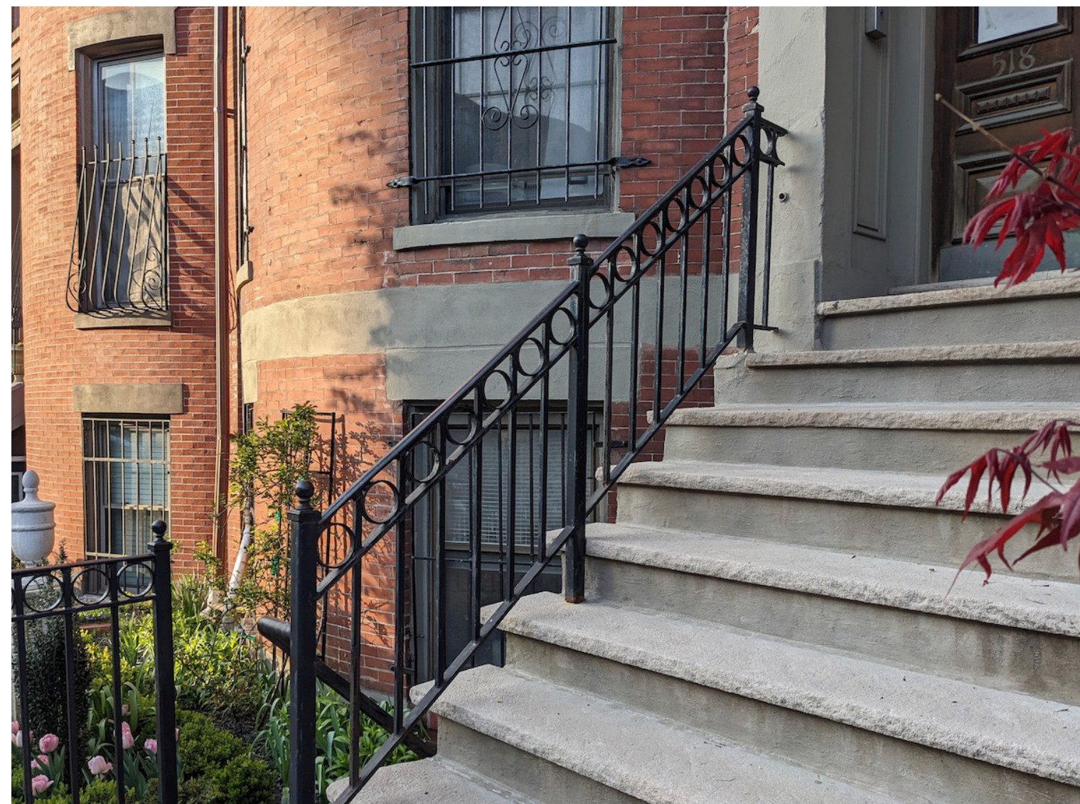
518 Massachusetts Ave.