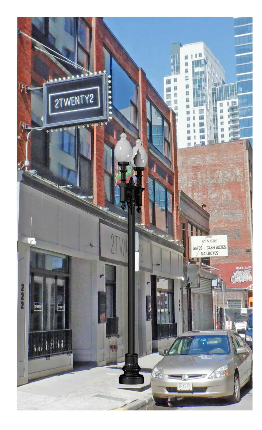
EXISTING PHOTOGRAPHIC VIEW