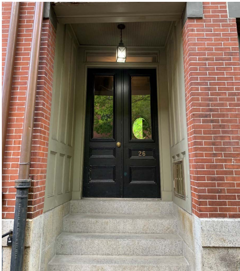
Photo of Existing Vestibule at 26 Hanson Street

Description of Handrail: The handrail will be ornamental metal painted black, approximately five and a half to seven feet long, and installed on the left side of the vestibule (same side as the operating door) with approximately three anchor points.