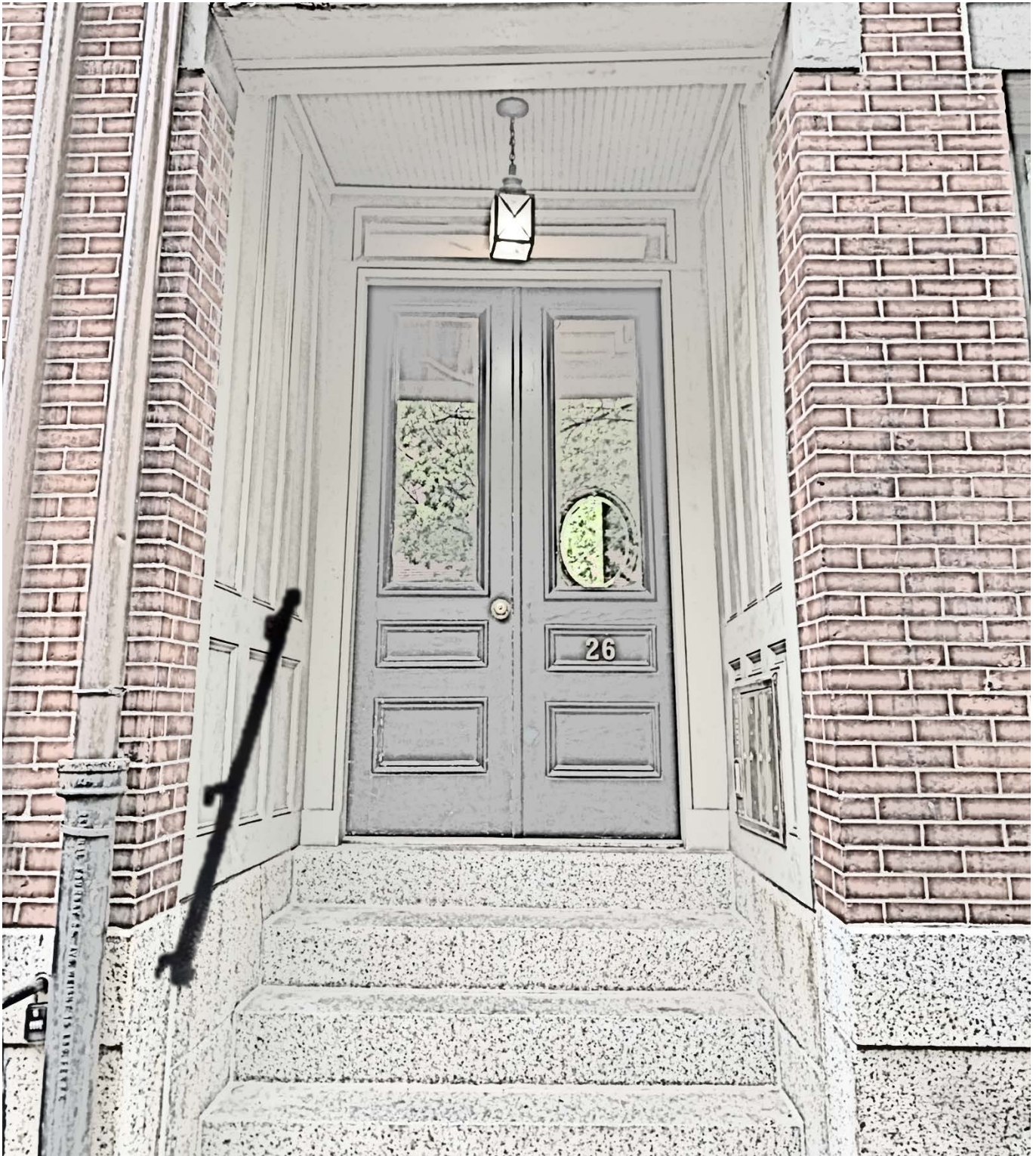
Digital Rendering of Handrail Installation at 26 Hanson Street