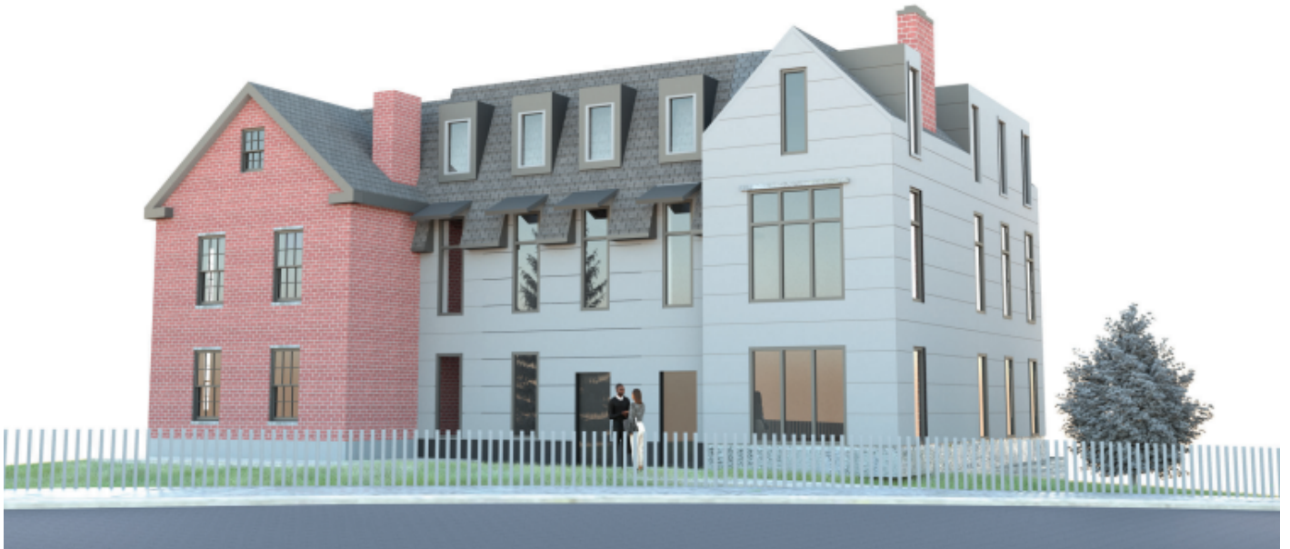
PERSPECTIVE FROM YARD