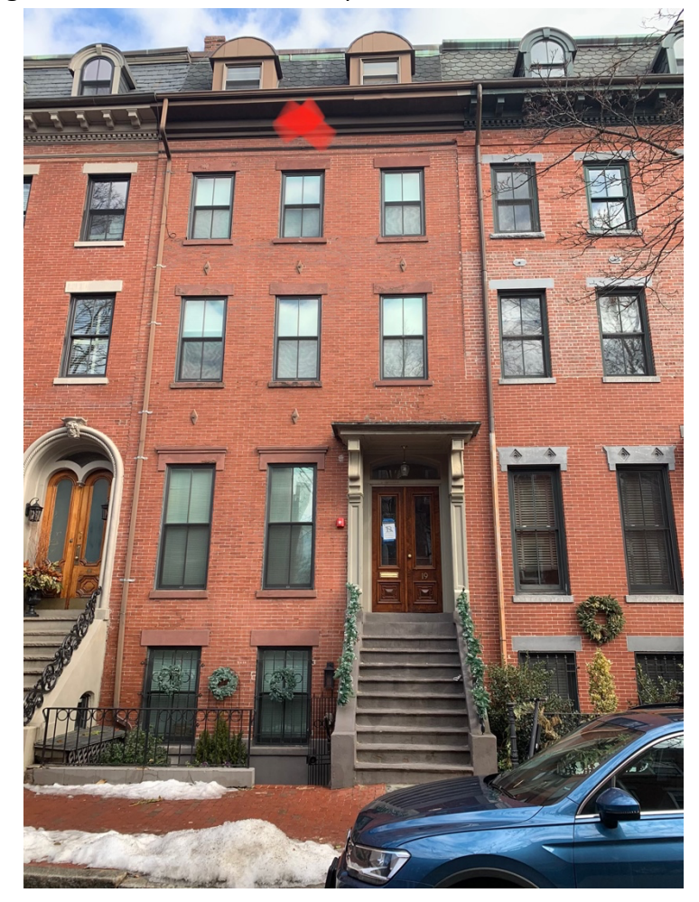
Figure 5. External elevation of painted duct cover would be approx. 36' and 9", above unit's middle window.

The elevation to where the dryer vent and its cover would go is roughly 36' 9". Here are images of approximately where the vent would exit the unit and the painted cover would be placed.