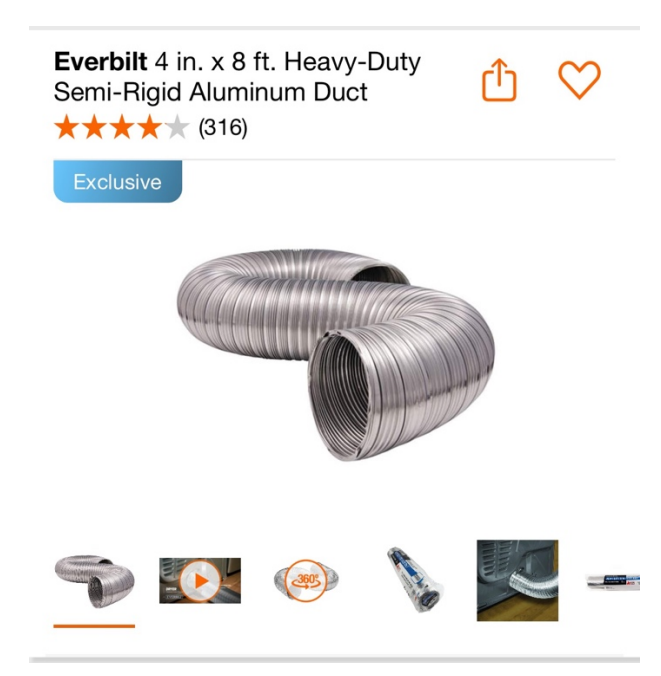
Figure 1: Proposed vent duct.

The vent duct would then pass through the wall to the outside of the building, just above the window (as noted with a red 'X' in the photos below). The dryer vent duct would be covered with a vent cover, which would be painted to help it blend into the brown-colored portion of the façade. The vent cover would be similar to the picture below, though painted to blend in.