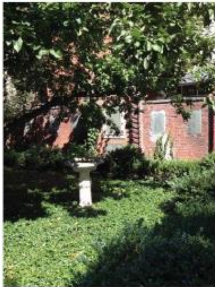
Existing Planting and Historic Plaques