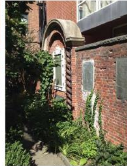
Existing Planting and Historic Plaques