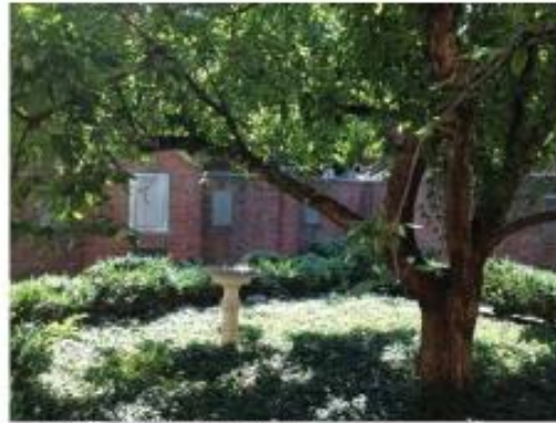
Existing Crabapple and Historic Plaques