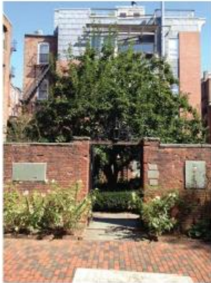
Existing Gateway and Crabapple