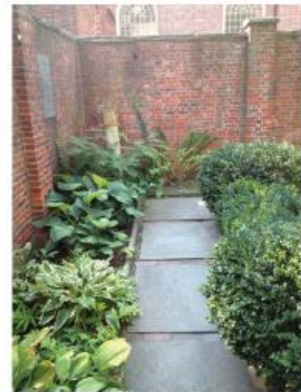
Existing Planting and Brick Walls