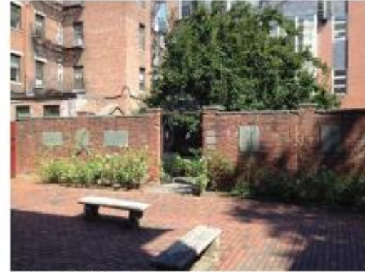
Existing Brick Walls with Historic Plaques