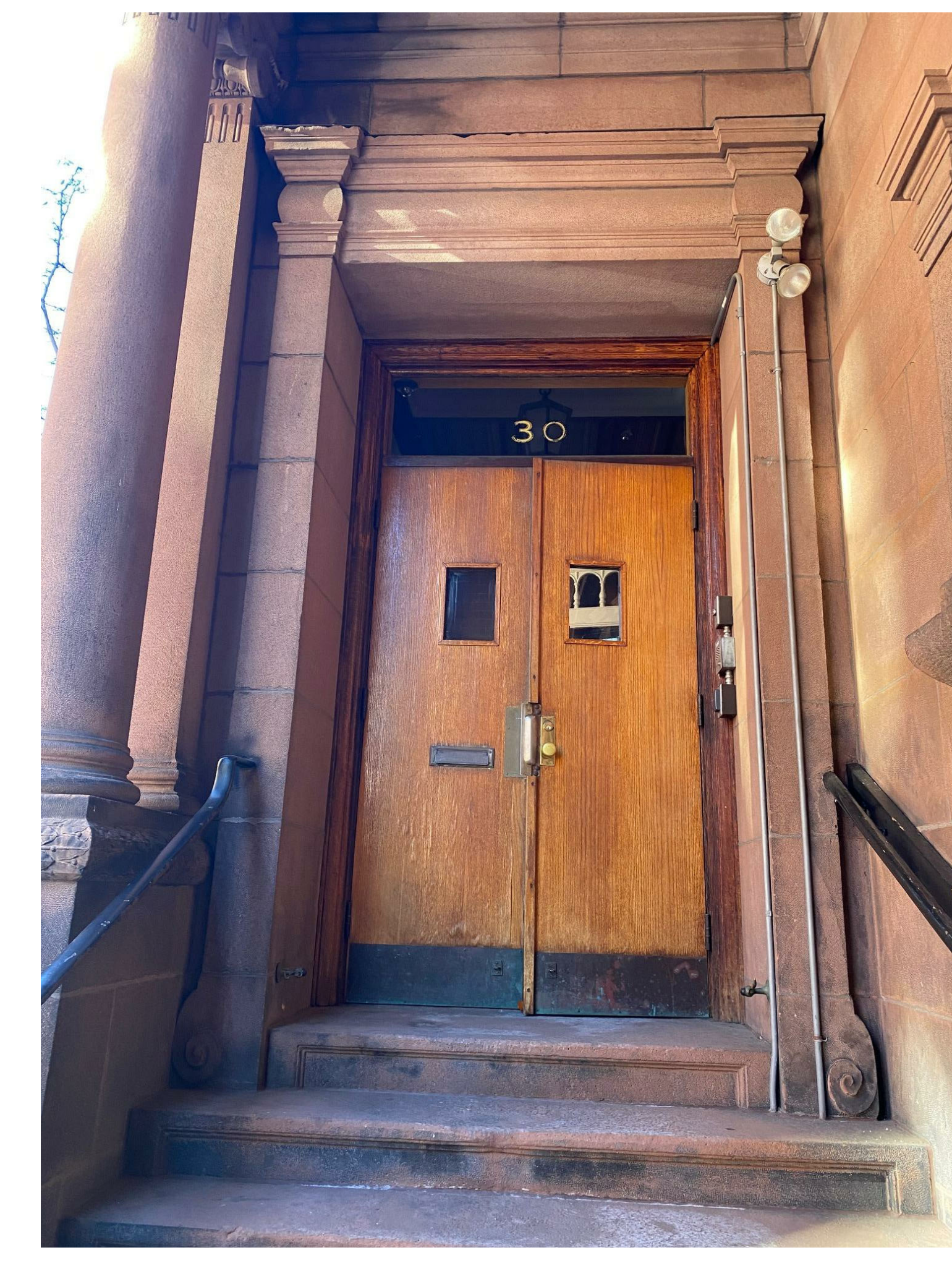
VIEW OF 30 FAIRFIELD STREET ENTRANCE PORCH WITH FLUSH WOOD EXTERIOR DOORS