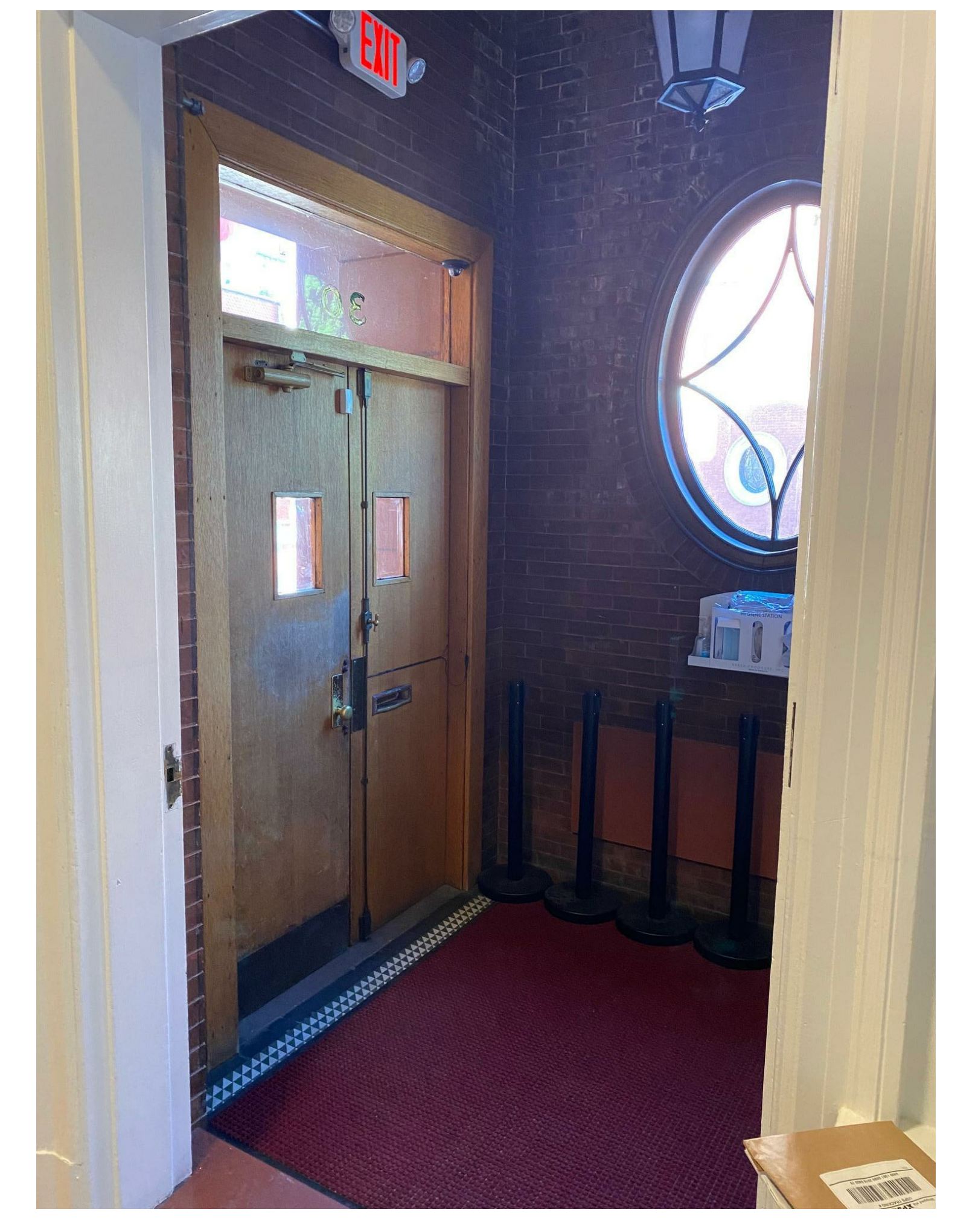
VIEW OF 30 FAIRFIELD STREET ENTRANCE VESTIBULE WITH FLUSH WOOD EXTERIOR DOORS