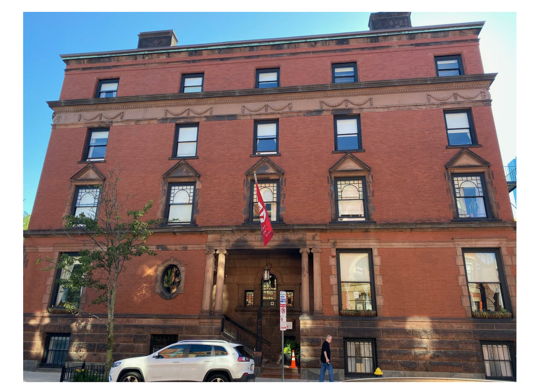
VIEW OF 30 FAIRFIELD STREET WITH ENTRANCE PORCH