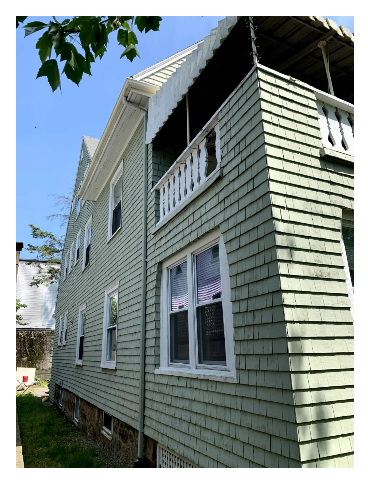
2 - Existing Left Elevation