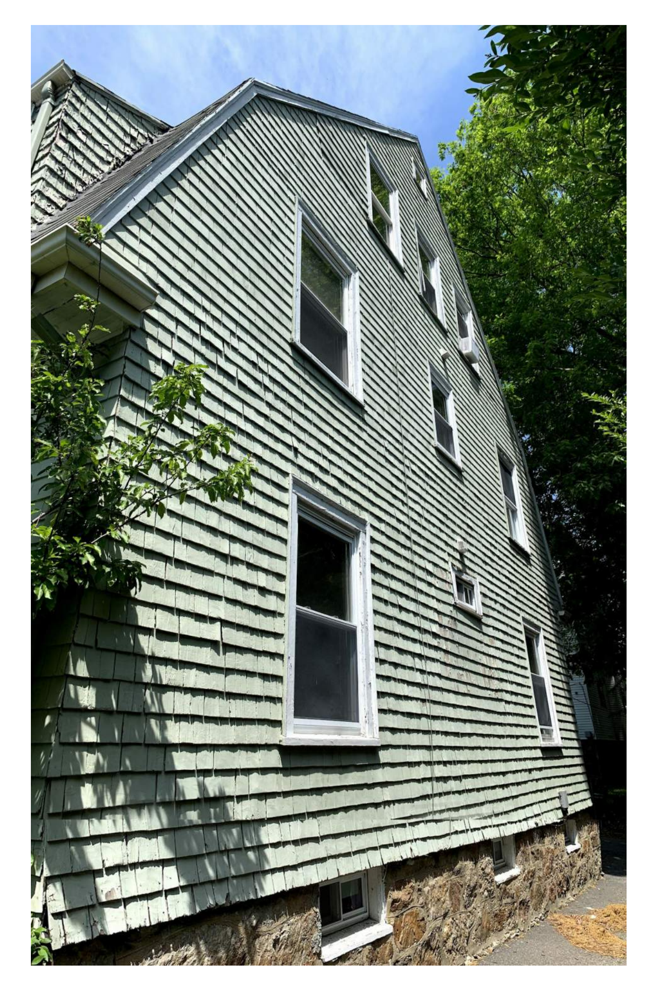
4 - Existing Right Elevation