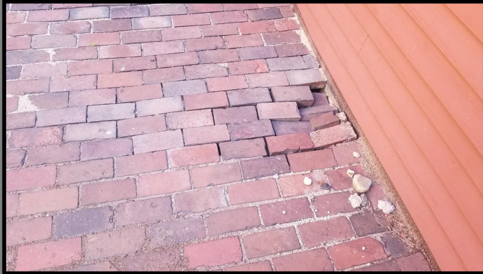
June 30, 2021