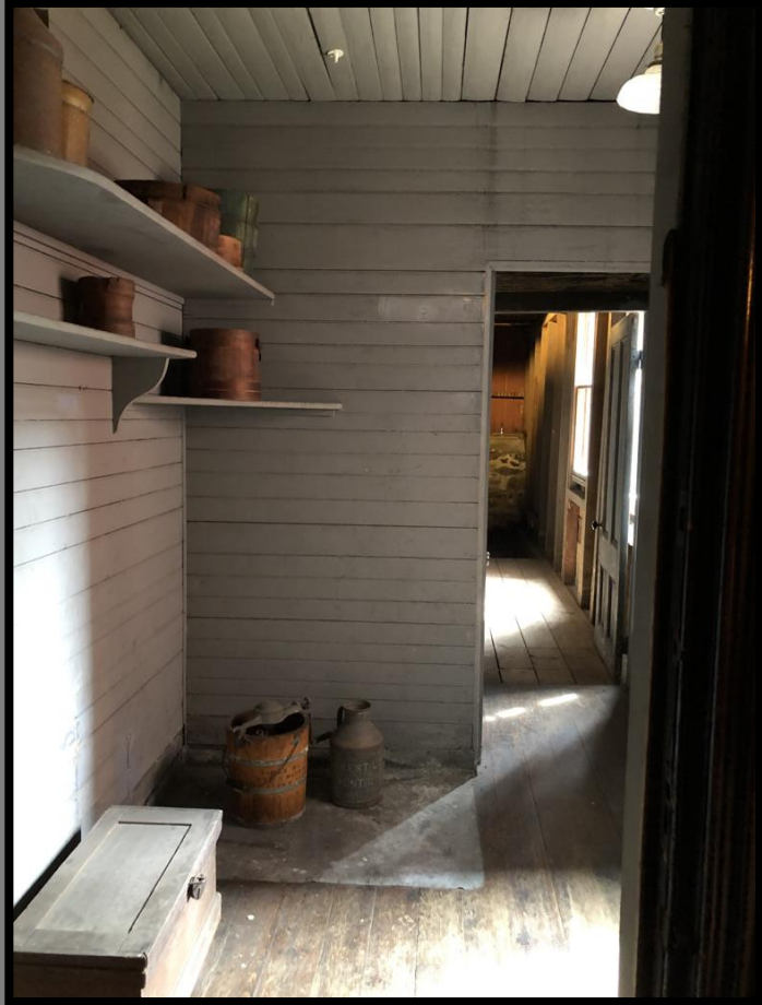
View from the kitchen door