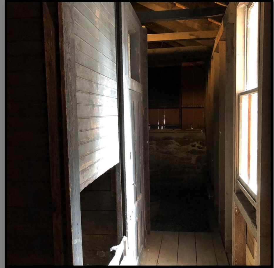
Looking into the coal storage area