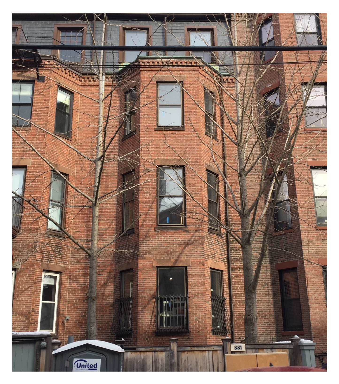
2.) FEMALE GINKGO (LEFT) MALE GINGKO (RIGHT)