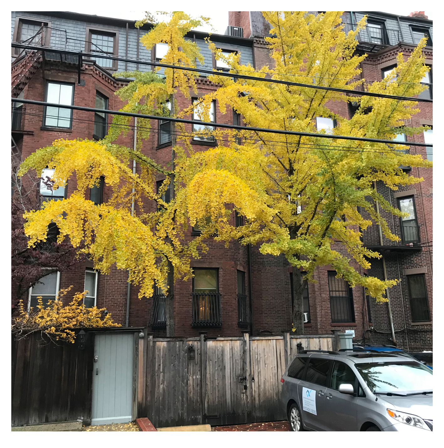
1.) FEMALE GINKGO (LEFT) MALE GINGKO (RIGHT)