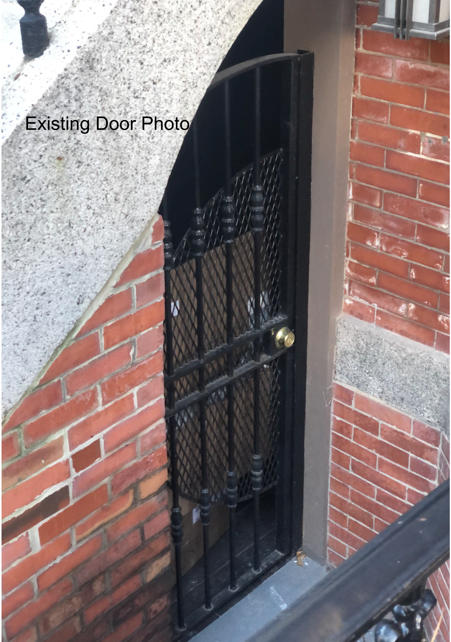
Existing Door Photo