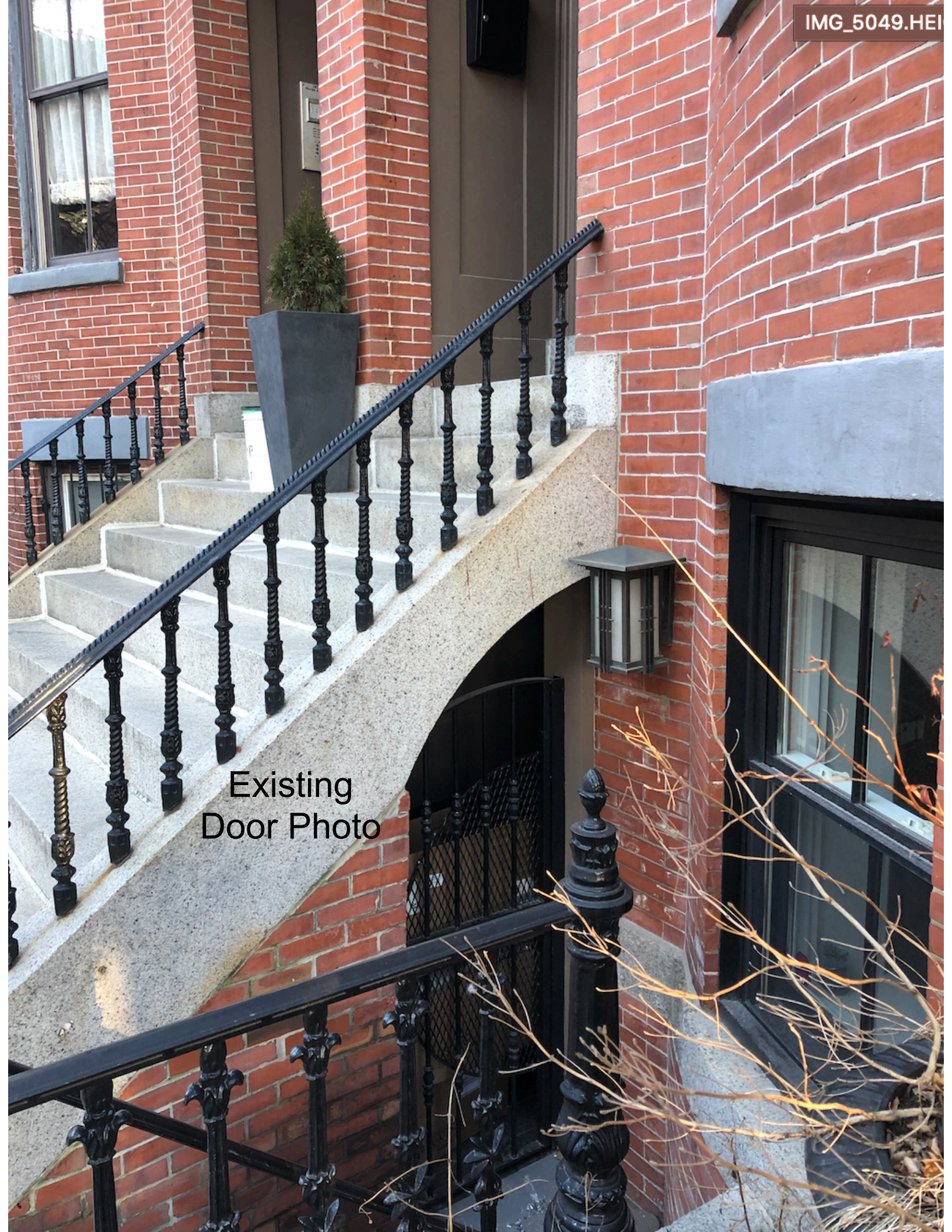
Existing Door Photo