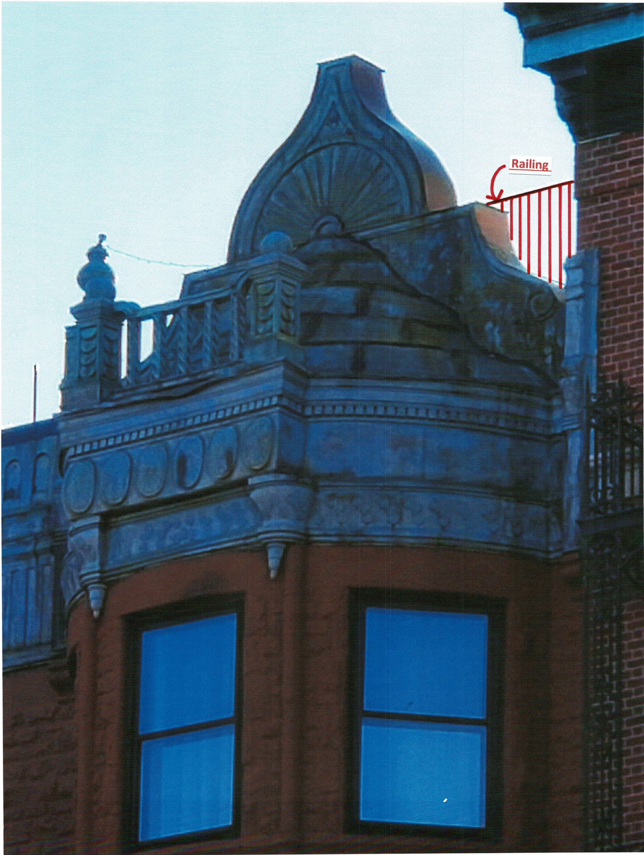
View from Pinckney Street