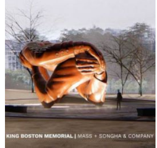
The Embrace by Hank Willis Thomas at Boston Common