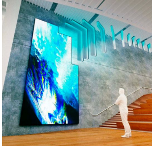
Memory/Diffusion by MASARY Studios at Boston Arts Academy