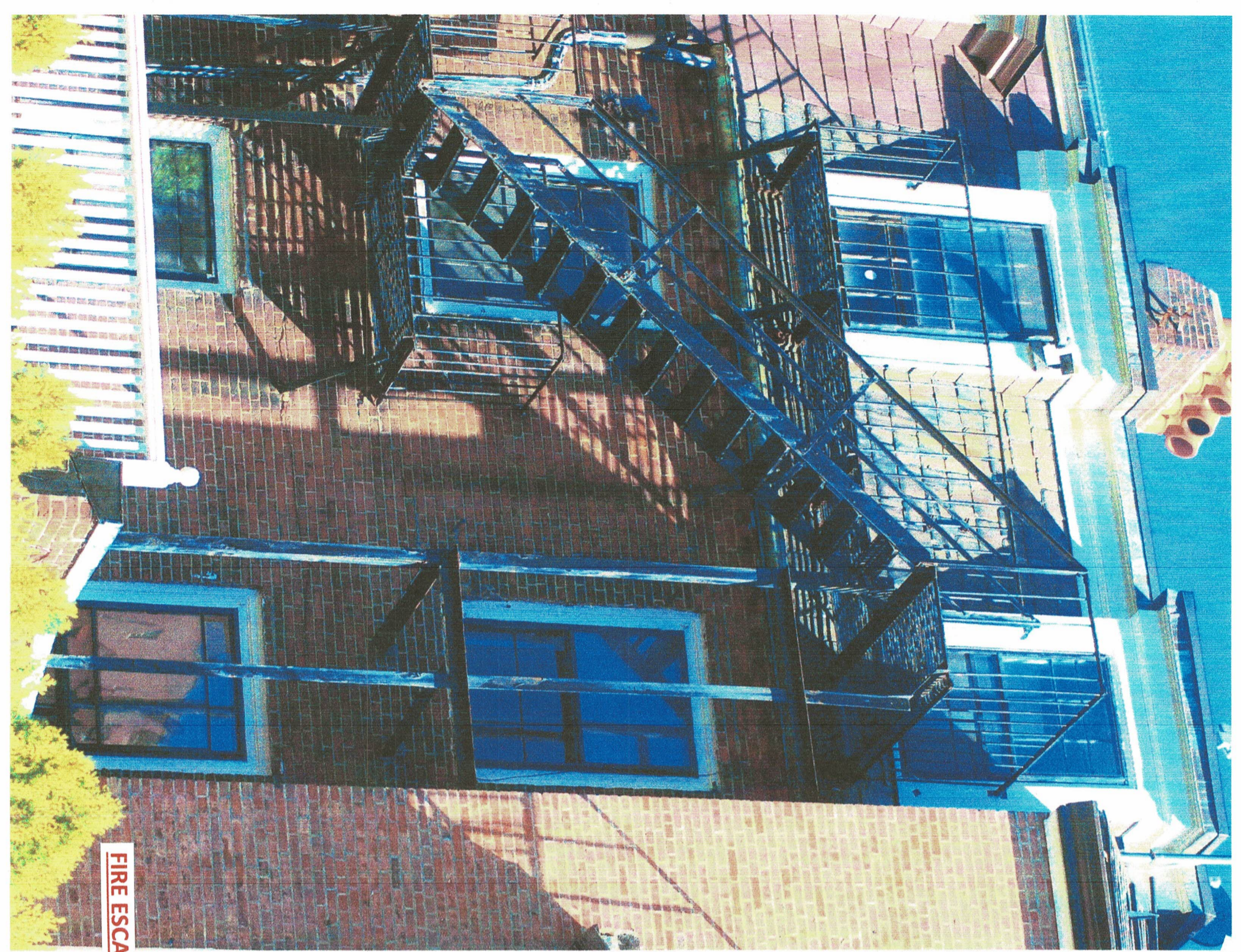
FIRE ESCAPES PHOTOS