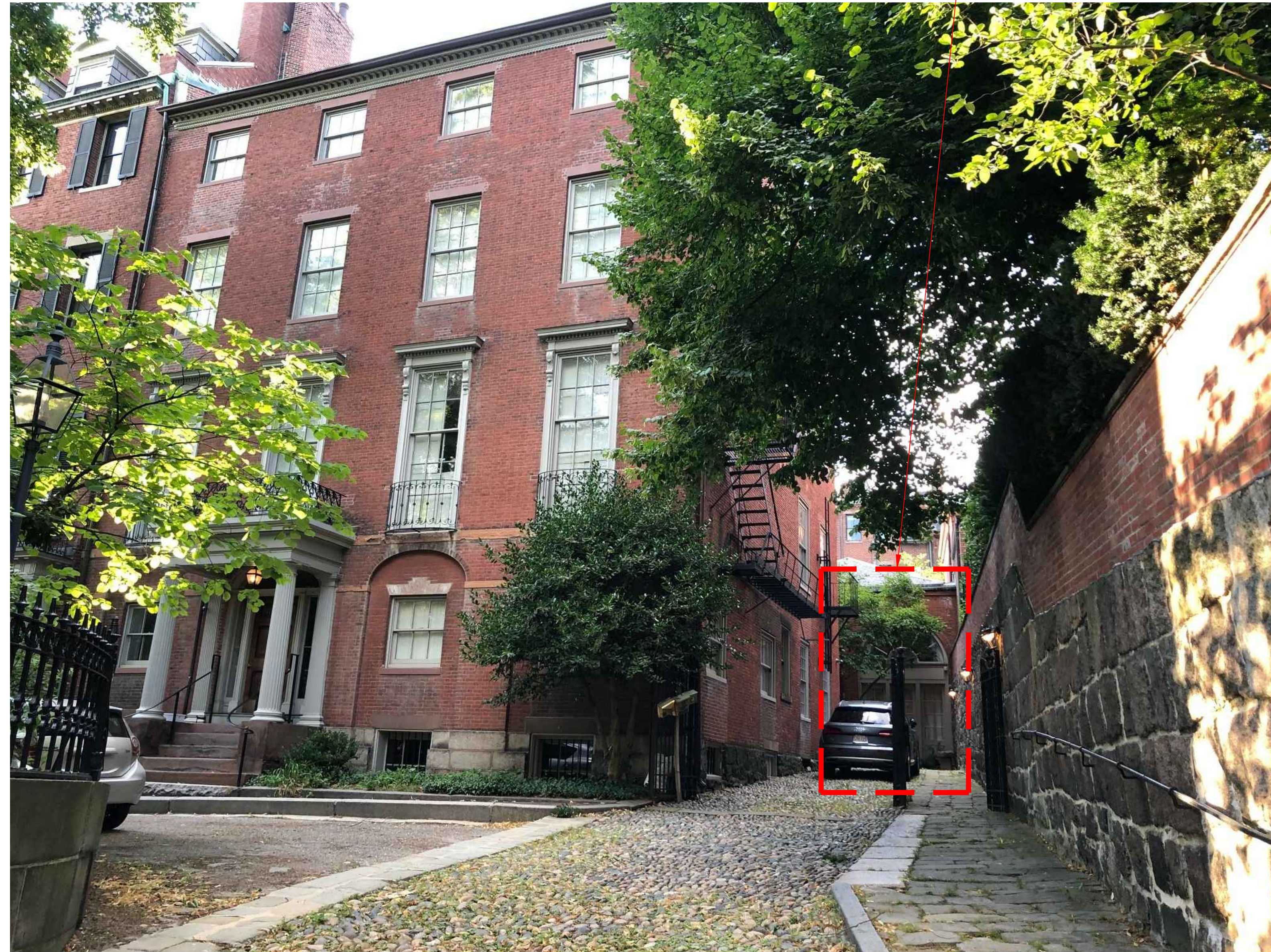
1 87 MT. VERNON STREET (MASSACHUSETTS COLONIAL SOCIETY) - FRONT ELEVATION SHOWING ADJACENT CARRIAGE HOUSE

DASHED LINE INDICATES LOCATION OF CARRIAGE HOUSE AT REAR OF 87 MOUNT VERNON STREET