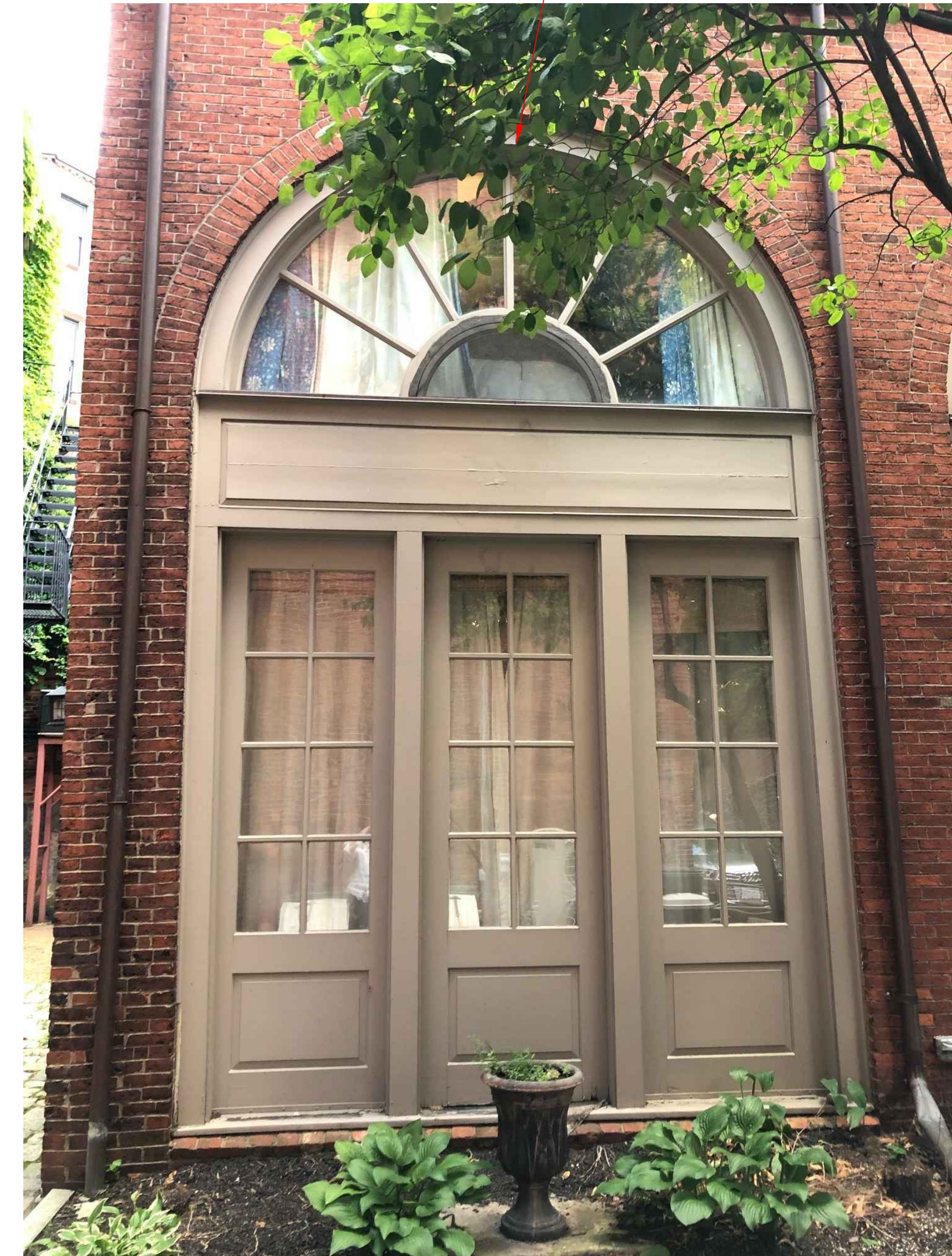
2 DOOR WINDOW UNIT AT CARRIAGE HOUSE (1 OF 2 UNITS)