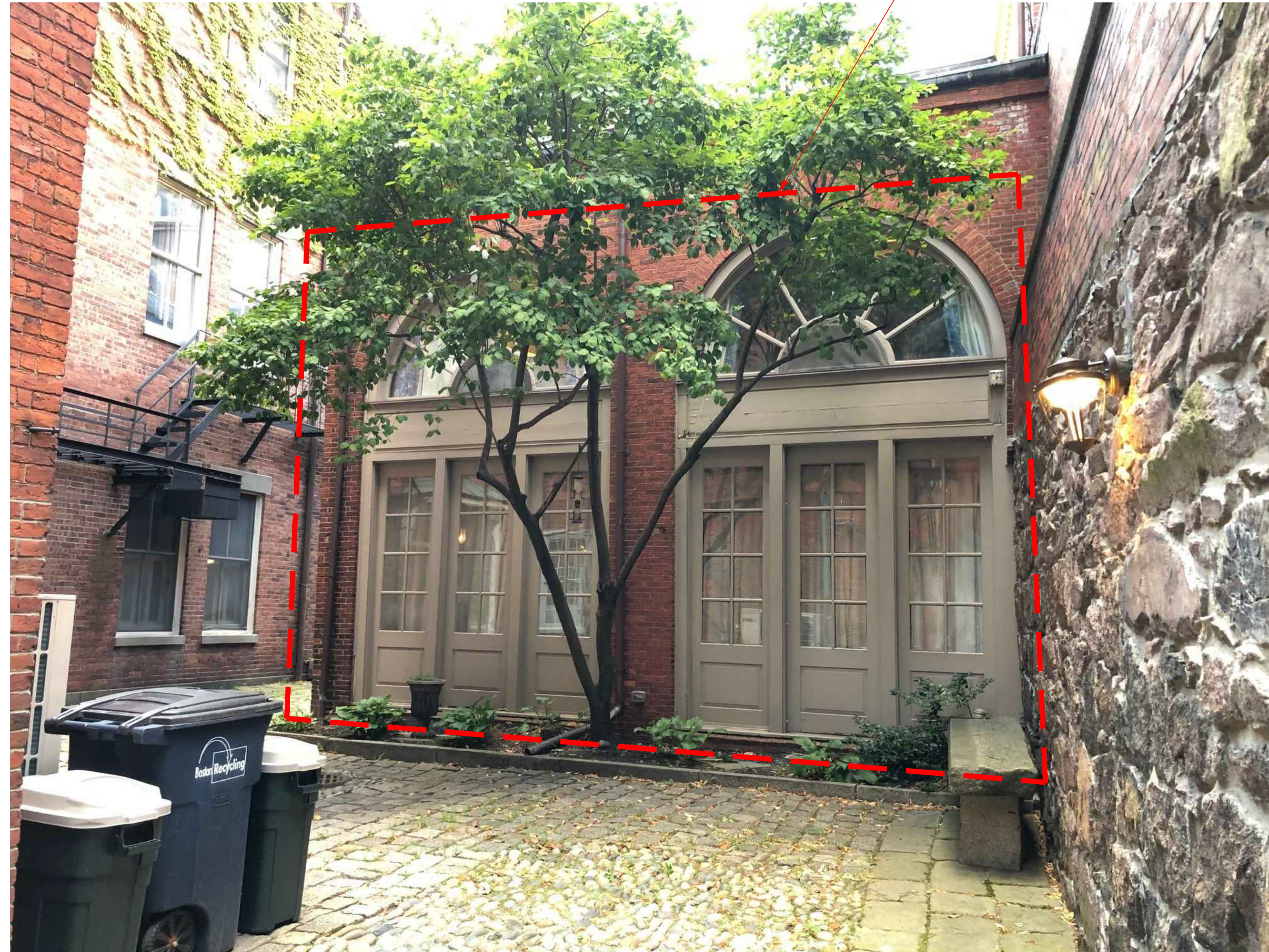
1 87 MT. VERNON STREET (MASSACHUSETTS COLONIAL SOCIETY) - CARRIAGE HOUSE DOORS/WINDOW ASSEMBLY TO BE REPLACED

CARRIAGE HOUSE DOORS/WINDOWS TO BE REPLACED; SEE ATTACHED SHOP DRAWING AND GENERAL NOTES BELOW.