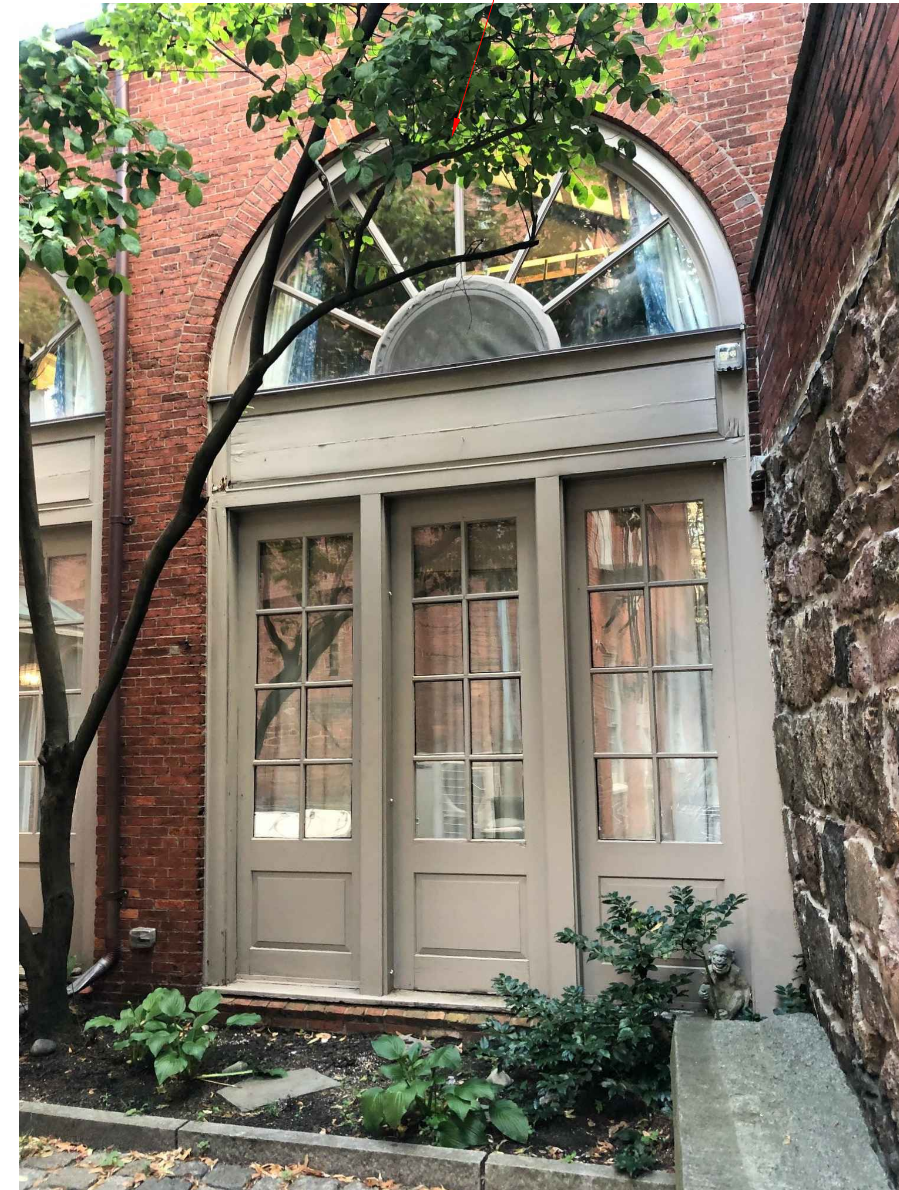
2 CARRIAGE HOUSE DOOR/WINDOW ASSEMBLY TO BE REPLACED

CARRIAGE HOUSE DOORS/WINDOWS TO BE REPLACED; SEE ATTACHED SHOP DRAWING, AND GENERAL NOTES BELOW.