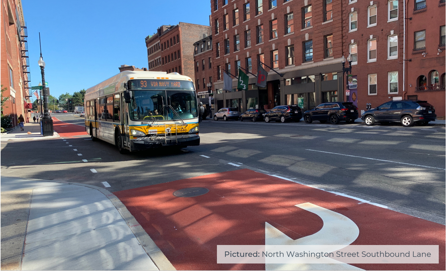
Pictured: North Washington Street Southbound Lane