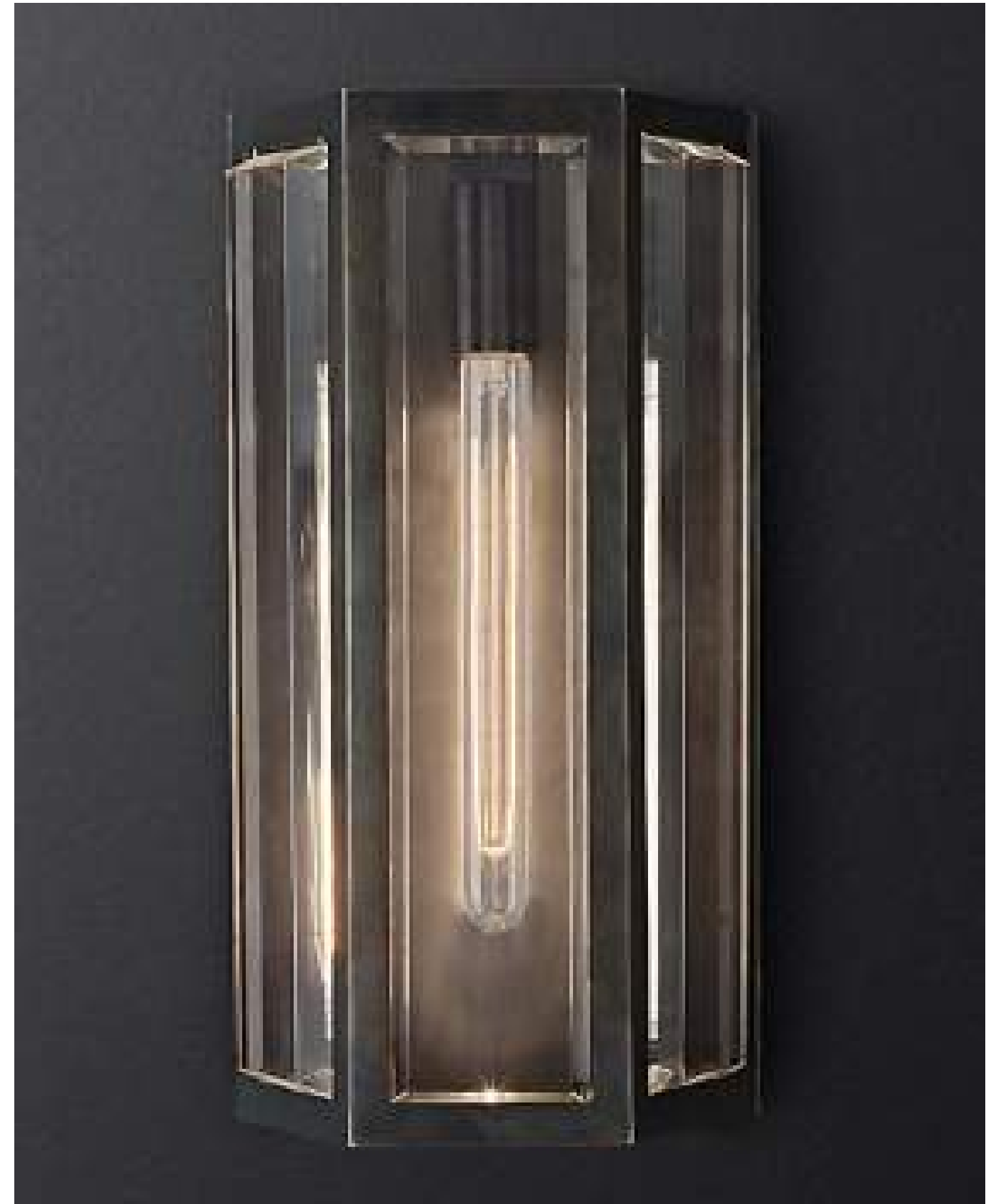
EXTERIOR LIGHT - RESTORATION HARDWARE CHEVALIER SCONCE IN BRONZE