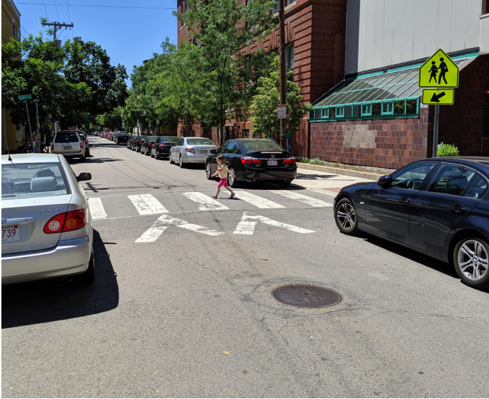
Photo: Raised Crosswalk

Raised crosswalks are at the level of the sidewalk, creating a safe crossing for children, older adults, or anyone