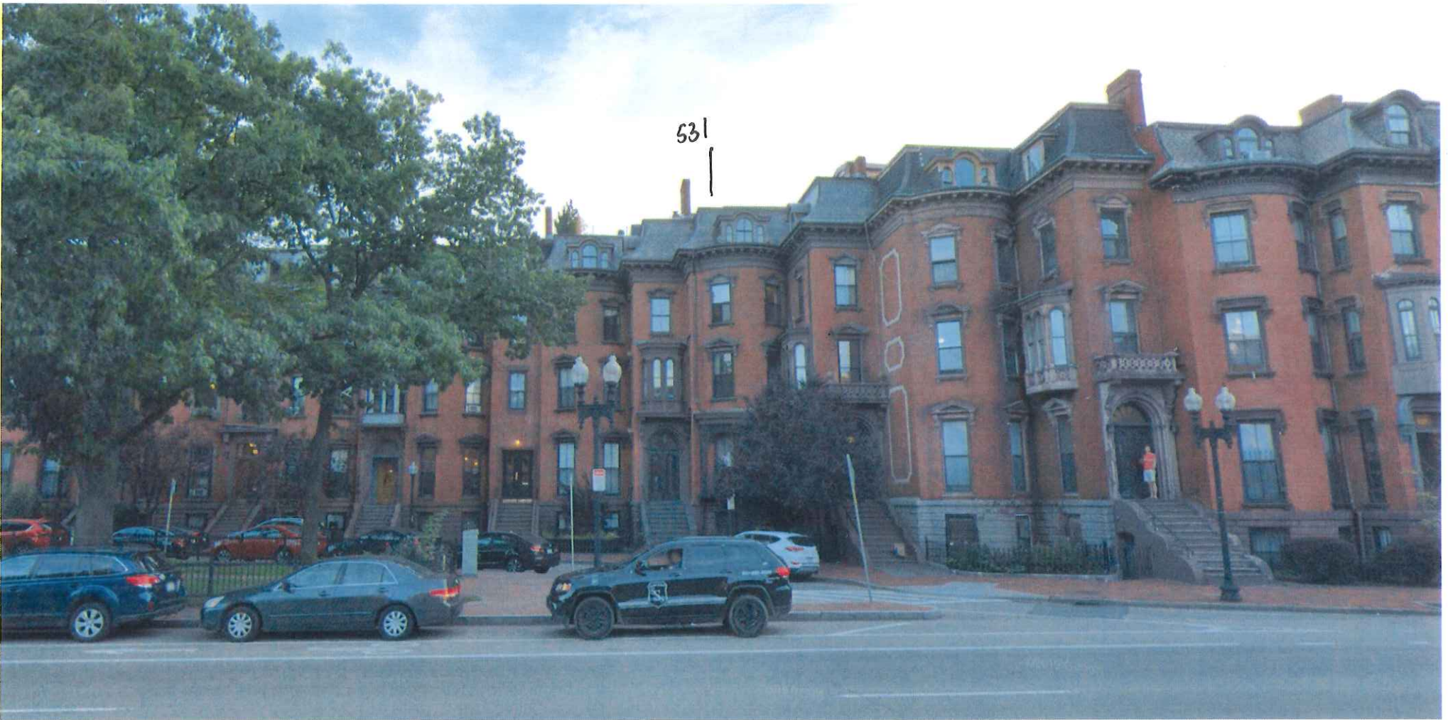
mass Ave View