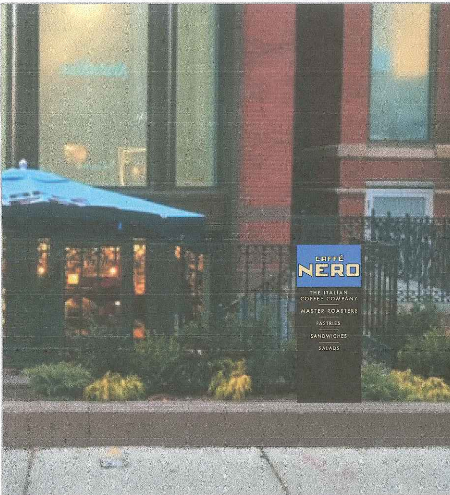
Newbury Street Blade Sign (DRAFT PROPOSAL)