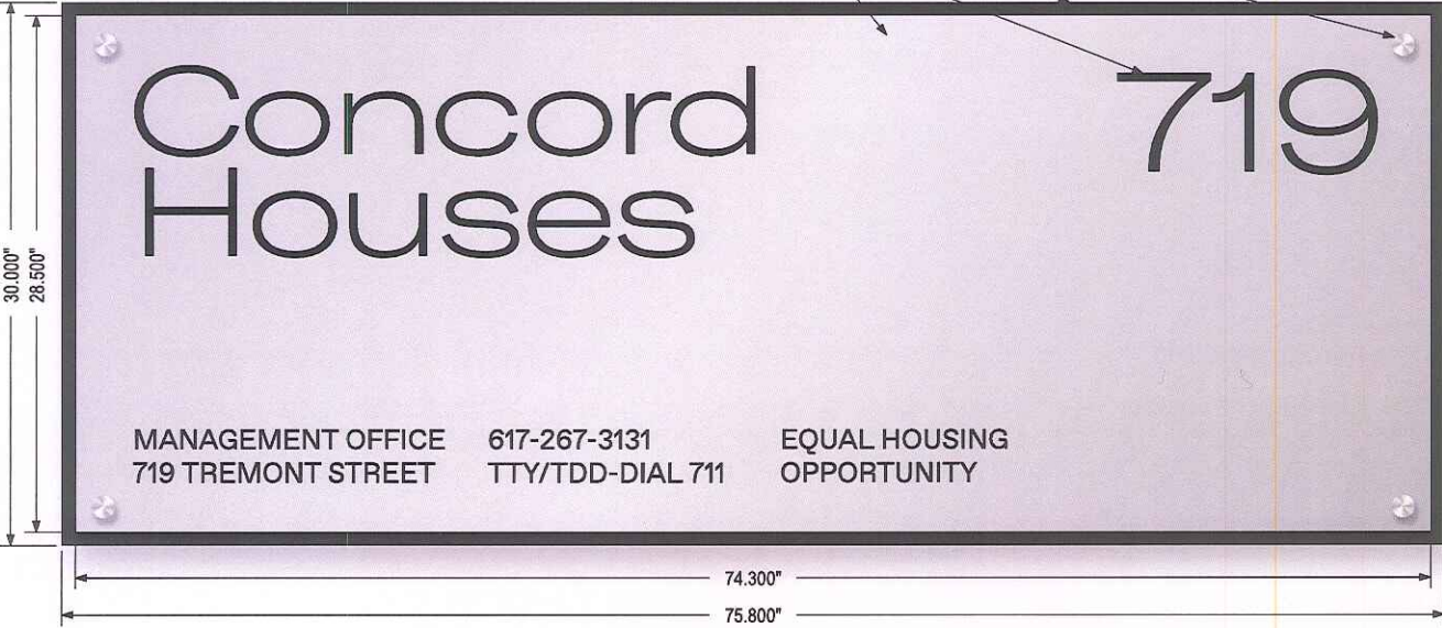
Title Management Office