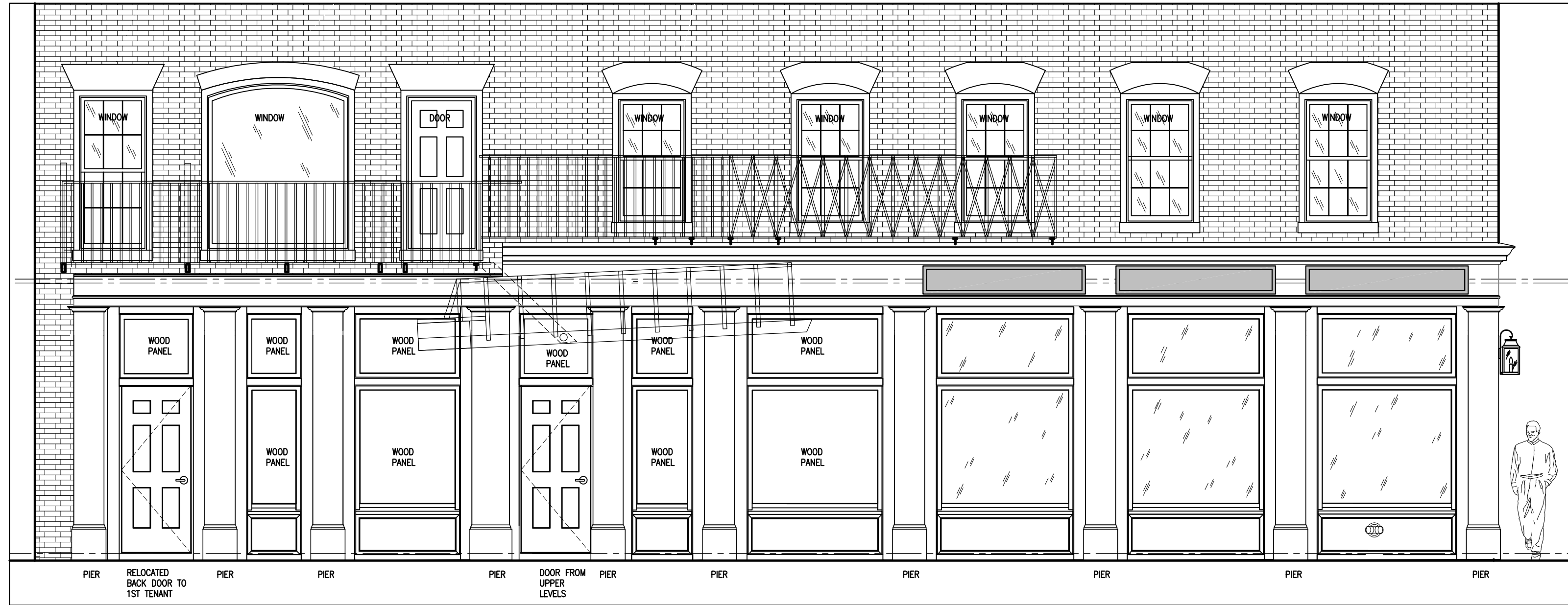
1 PROPOSED ELEVATION ALONG PARKING ALLEY - MILLWORK LINTELS AND PIERS - OPTION 8 SCALE: 1/4" = 1'-0"

222 BERKELEY ST. FL 2 BOSTON, MA. 02116 PHONE: 617.457.0990 www.vca-arch.com