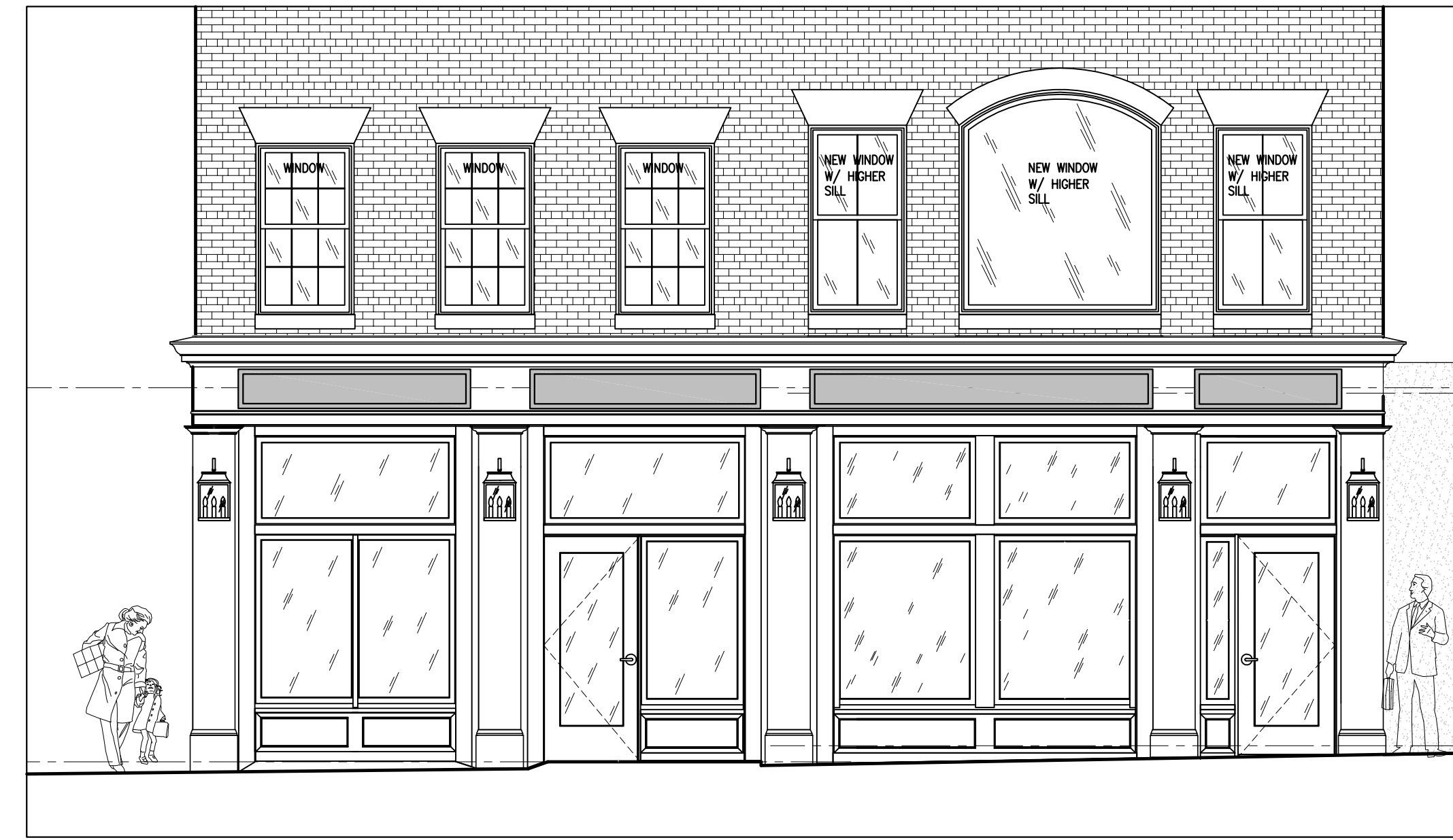
2 PROPOSED ELEVATION ALONG BROAD STREET - MILLWORK LINTELS AND PIERS - OPTION 8 SCALE: 1/4" = 1'-0"