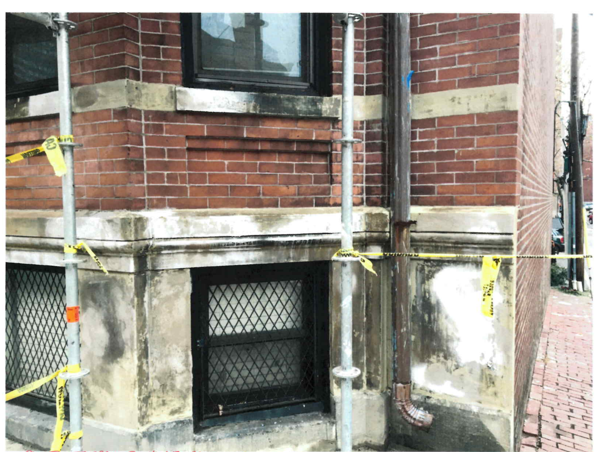
PAINT STRIPPED @ #45 - EAST SIDE JAN. 2017