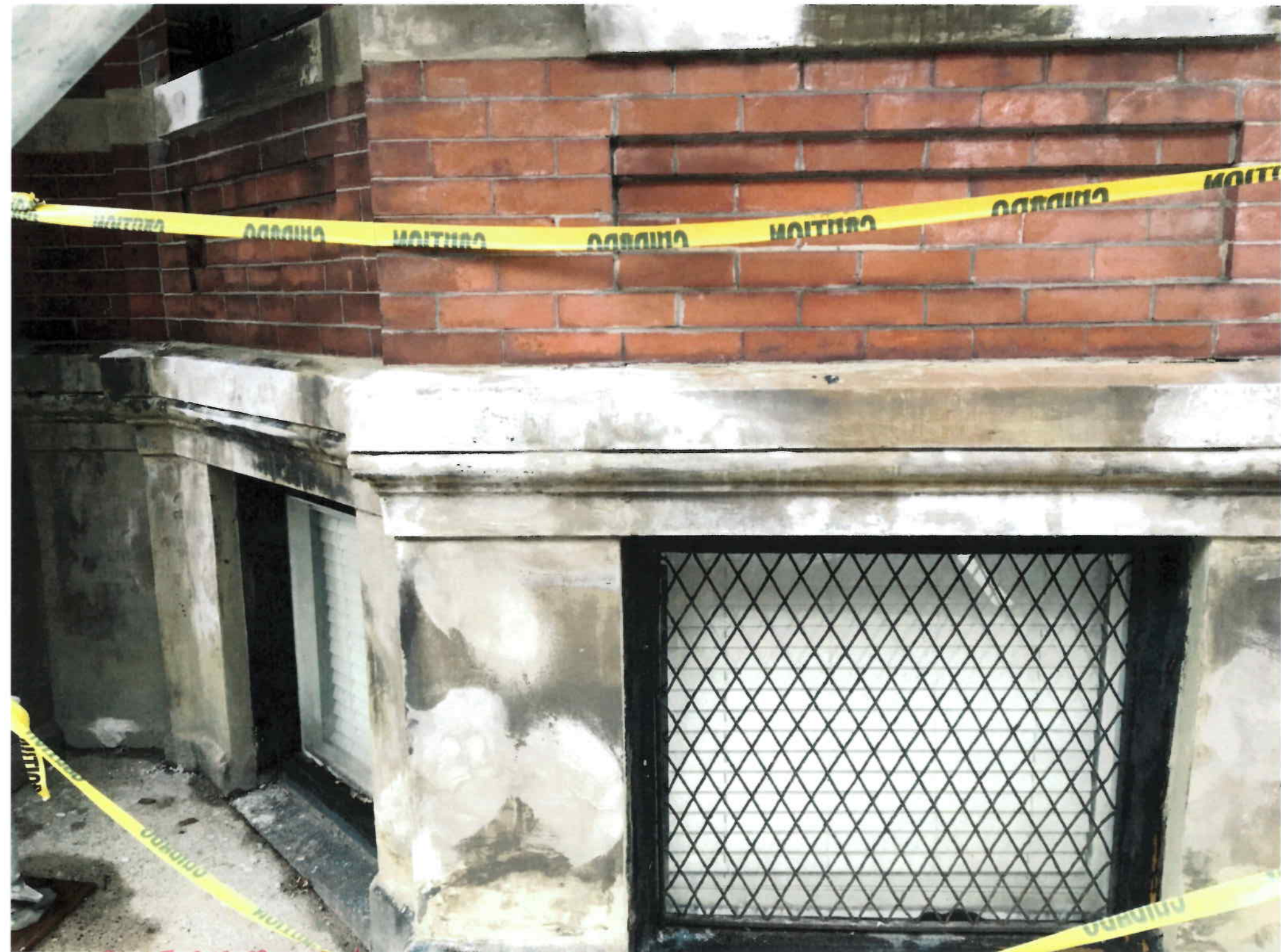
PAINT STRIPPED @ # 45 - EAST SIDE JAN 2017