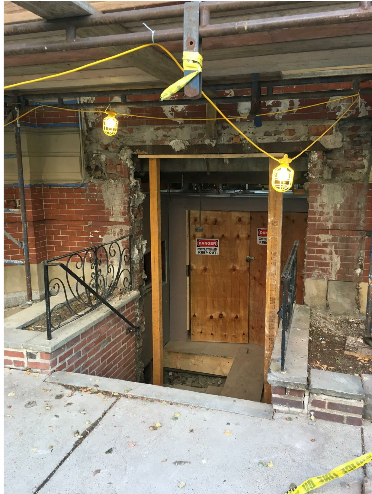
PHOTO 1. CONSTRUCTION PHOTO SHOWING THE EXISTING OPENING AT 11 EXETER ST. GRANITE CLADDING WAS UNSTABLE AND NEEDED TO BE REMOVED.