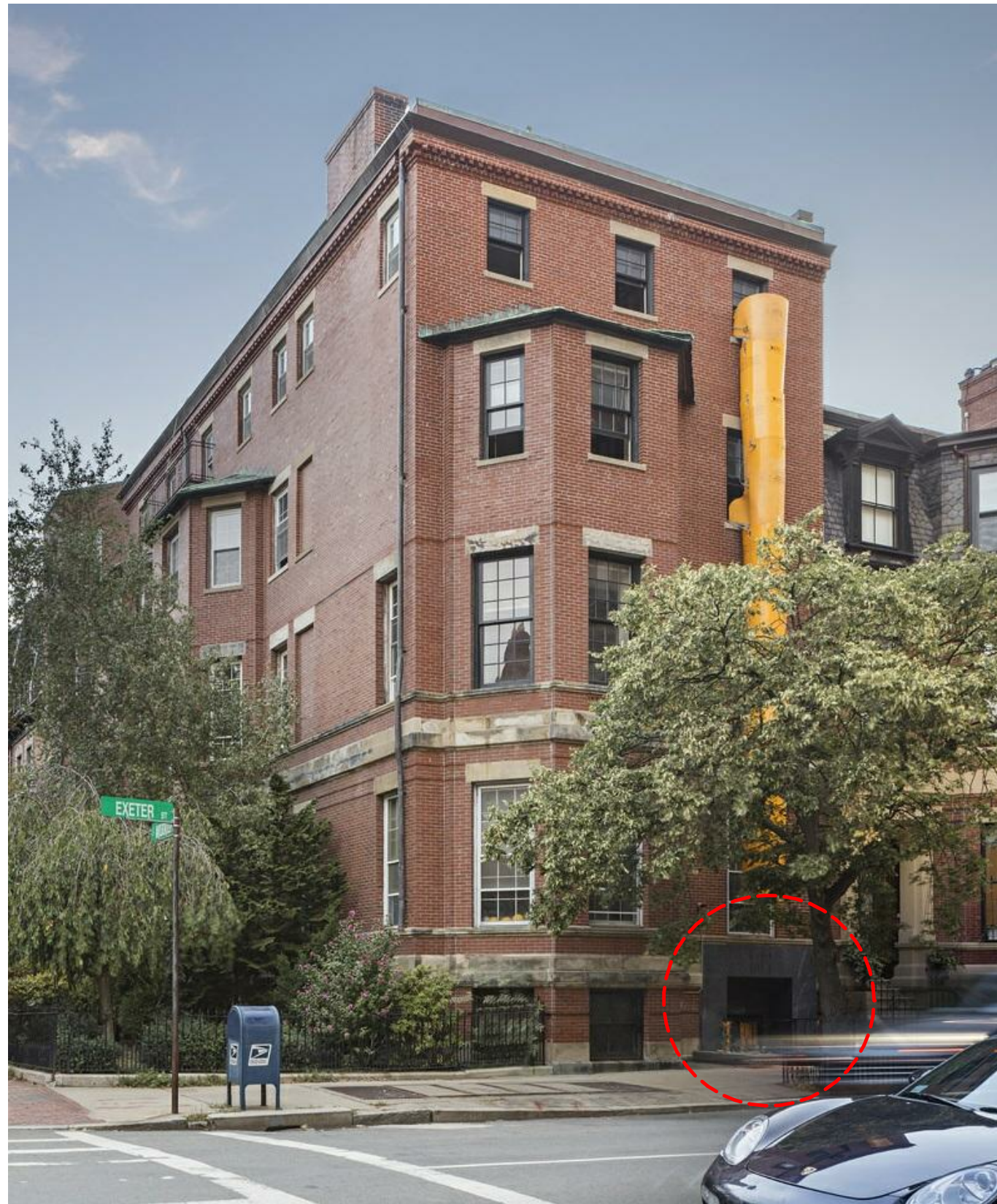
PHOTO 1. VIEW FROM CORNER OF EXETER AND MARLBOROUGH ST