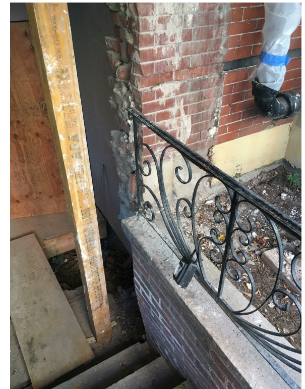
PHOTO 5. BOTTOM RIGHT AT OPENING