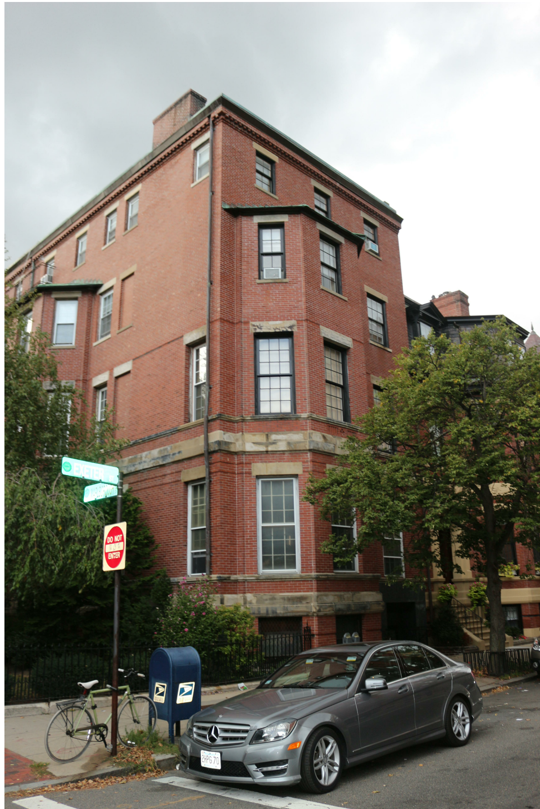
11 EXETER STREET