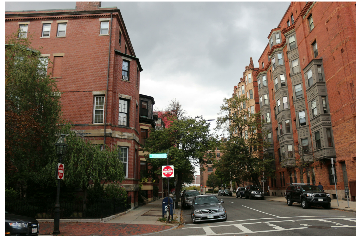
NORTH SIDE OF MARLBOROUGH STREET - FACING NORTH WEST