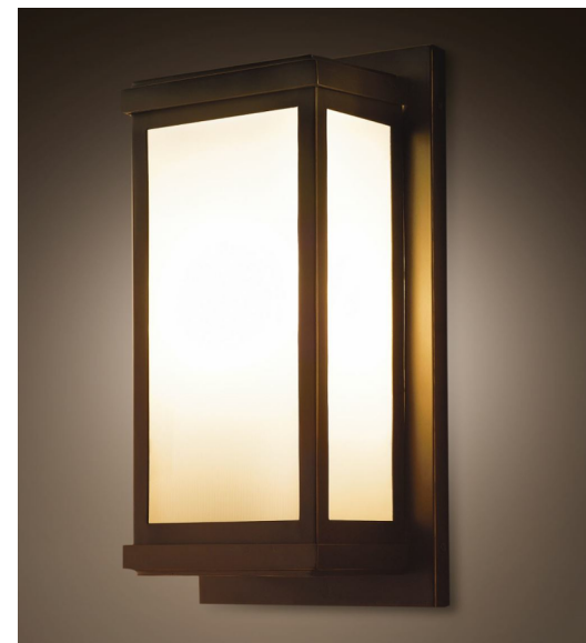
PHOTO 2. PROPOSED BRAXTON SCONCE IN BRONZE

REBUILD BRICK CHEEK WALL IN KIND. REUSE EXISTING STONE CAP ON NEW WALL. RE-INSTALL EXISTING METAL RAILINGS.