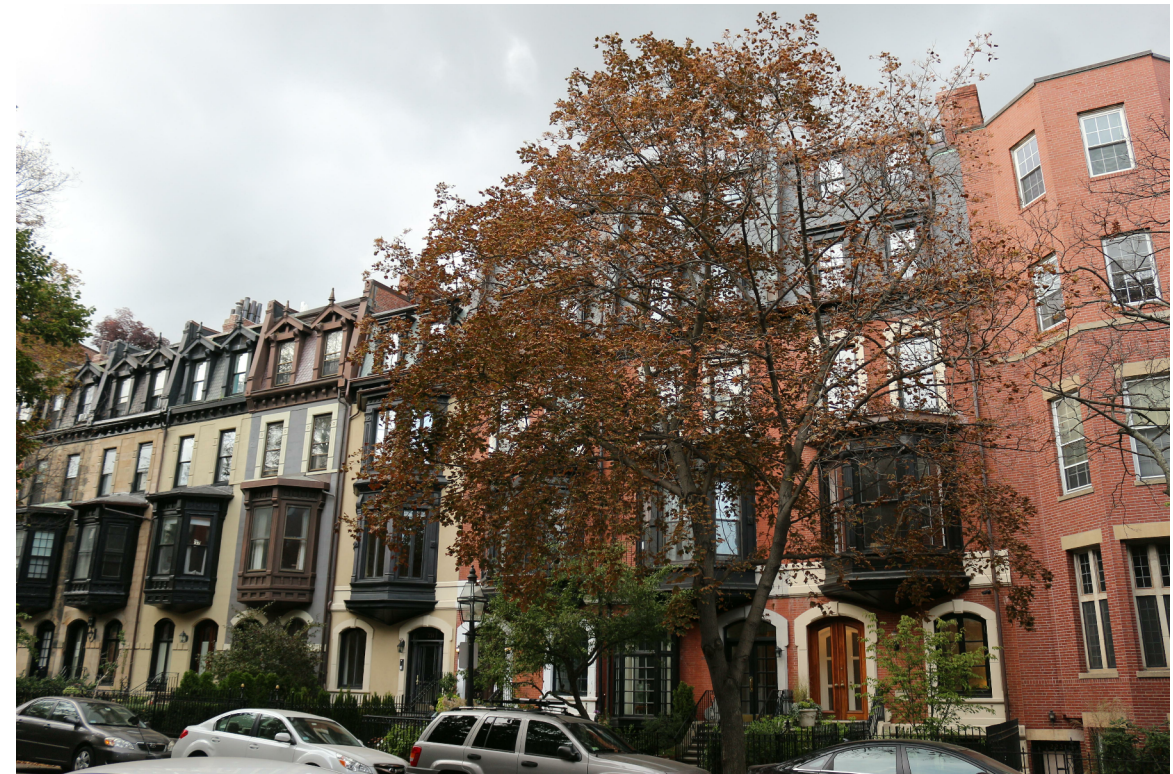
NORTH SIDE OF MARLBOROUGH STREET - FACING NORTH WEST