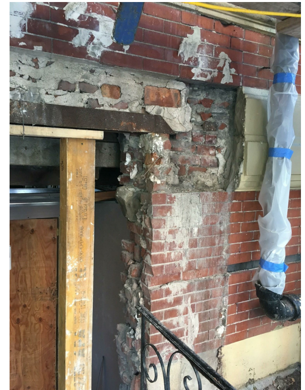
PHOTO 3. TOP RIGHT AT OPENING