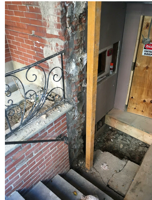
PHOTO 4. BOTTOM LEFT AT OPENING