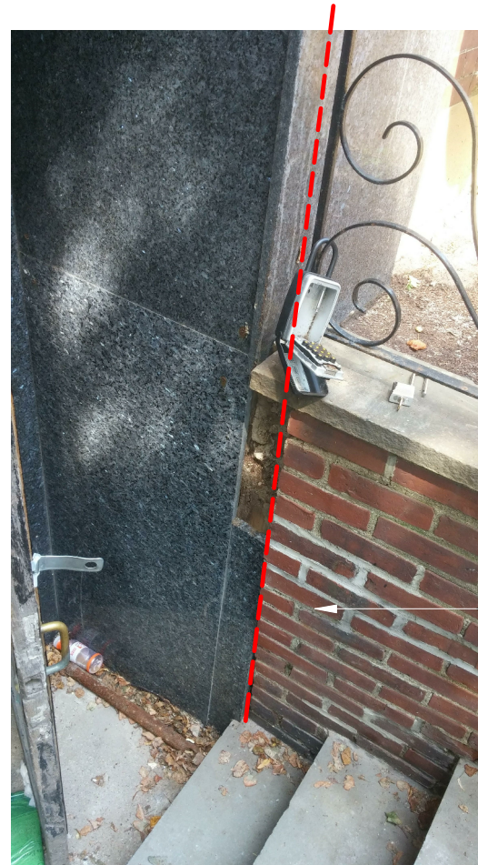
PHOTO 1. EXISTING BRICK CHEEK WALL

REBUILD BRICK CHEEK WALL IN KIND. REUSE EXISTING STONE CAP ON NEW WALL. RE-INSTALL EXISTING METAL RAILINGS.