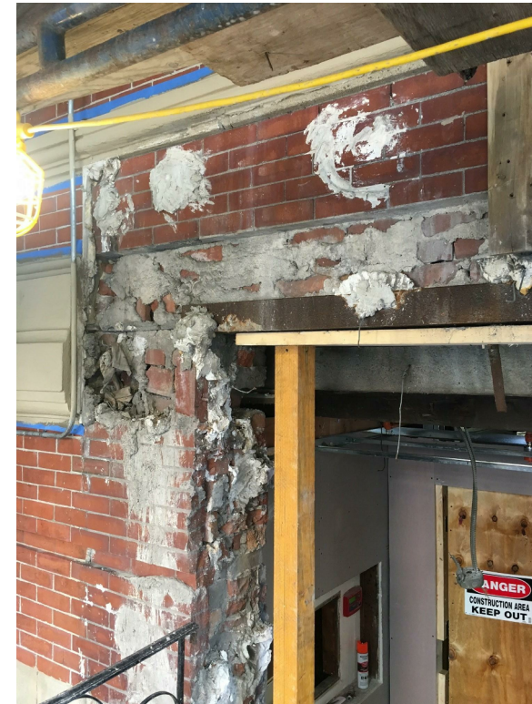
PHOTO 2. TOP LEFT AT OPENING