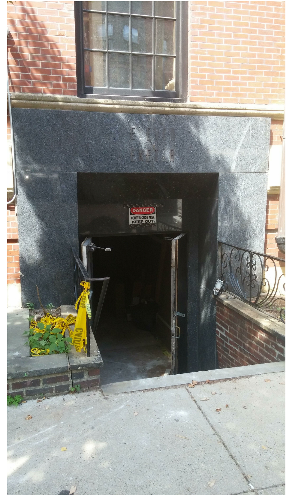
PHOTO 2. GRANITE CLADDING AT 11 EXETER ENTRY BEFORE CONSTRUCTION