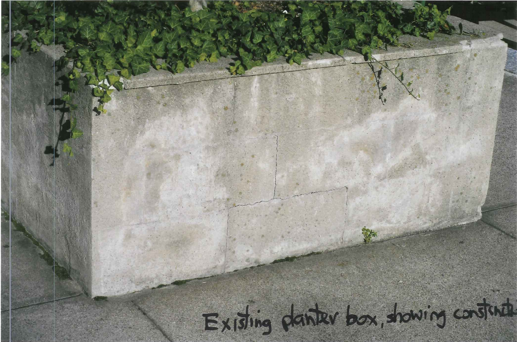
Existing planter box, showing construction