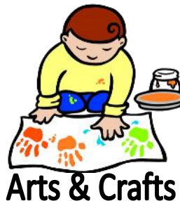
Arts & Crafts